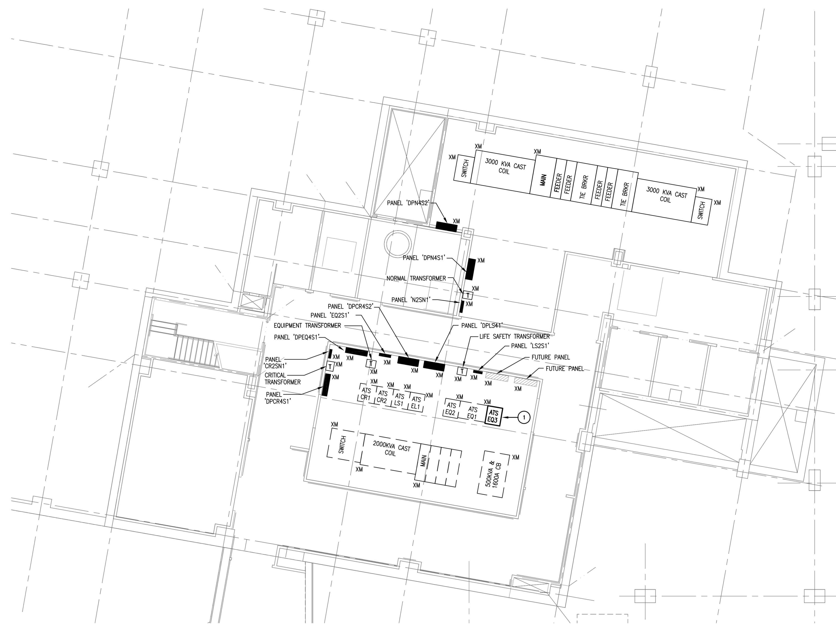
EXISTING MAIN ELECTRIC ROOM PART PLAN 1/4"=1'-0"