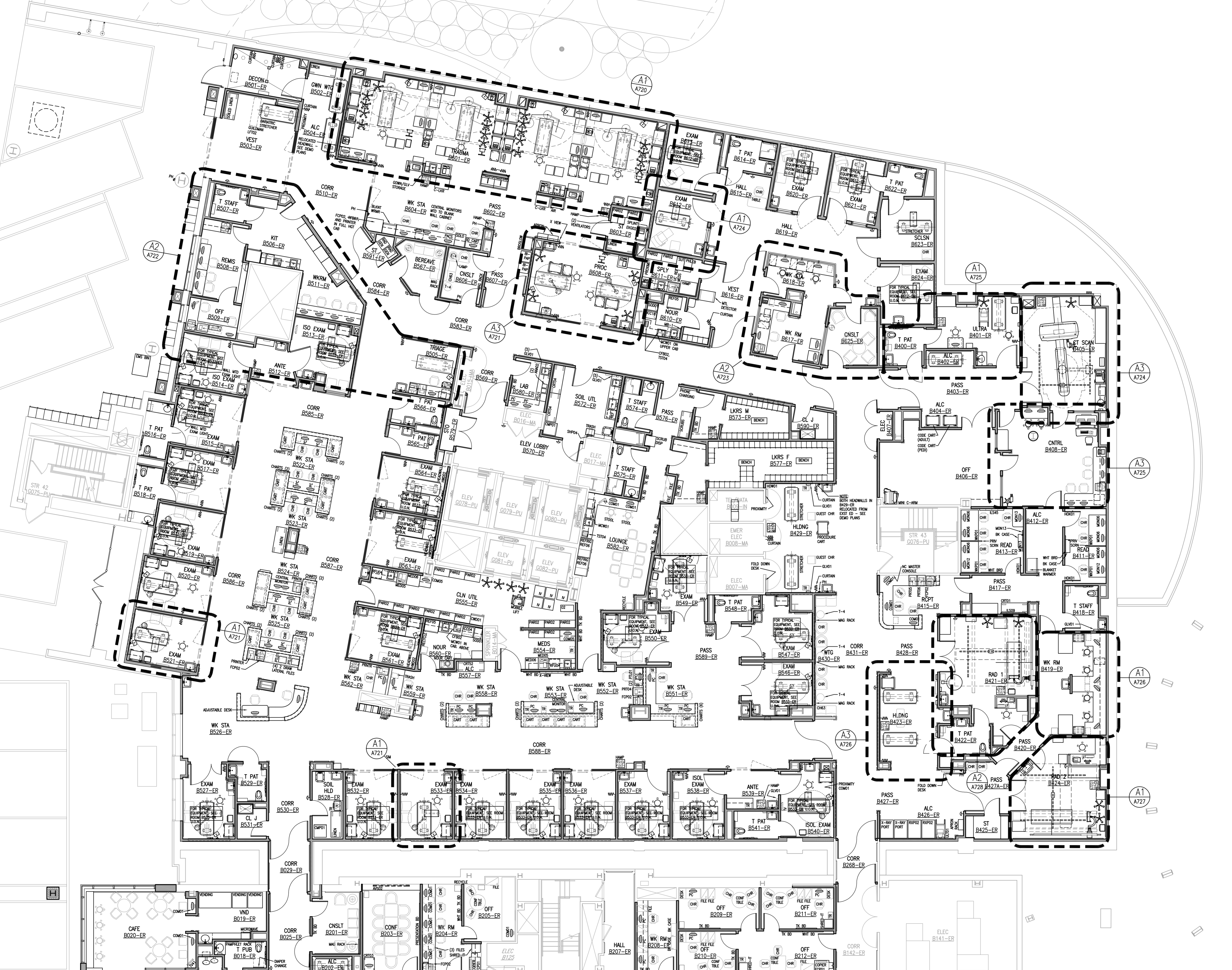
BASEMENT FLOOR PLAN SECTOR A EQUIPMENT PLAN SCALE: 1/8" = 1'-0"