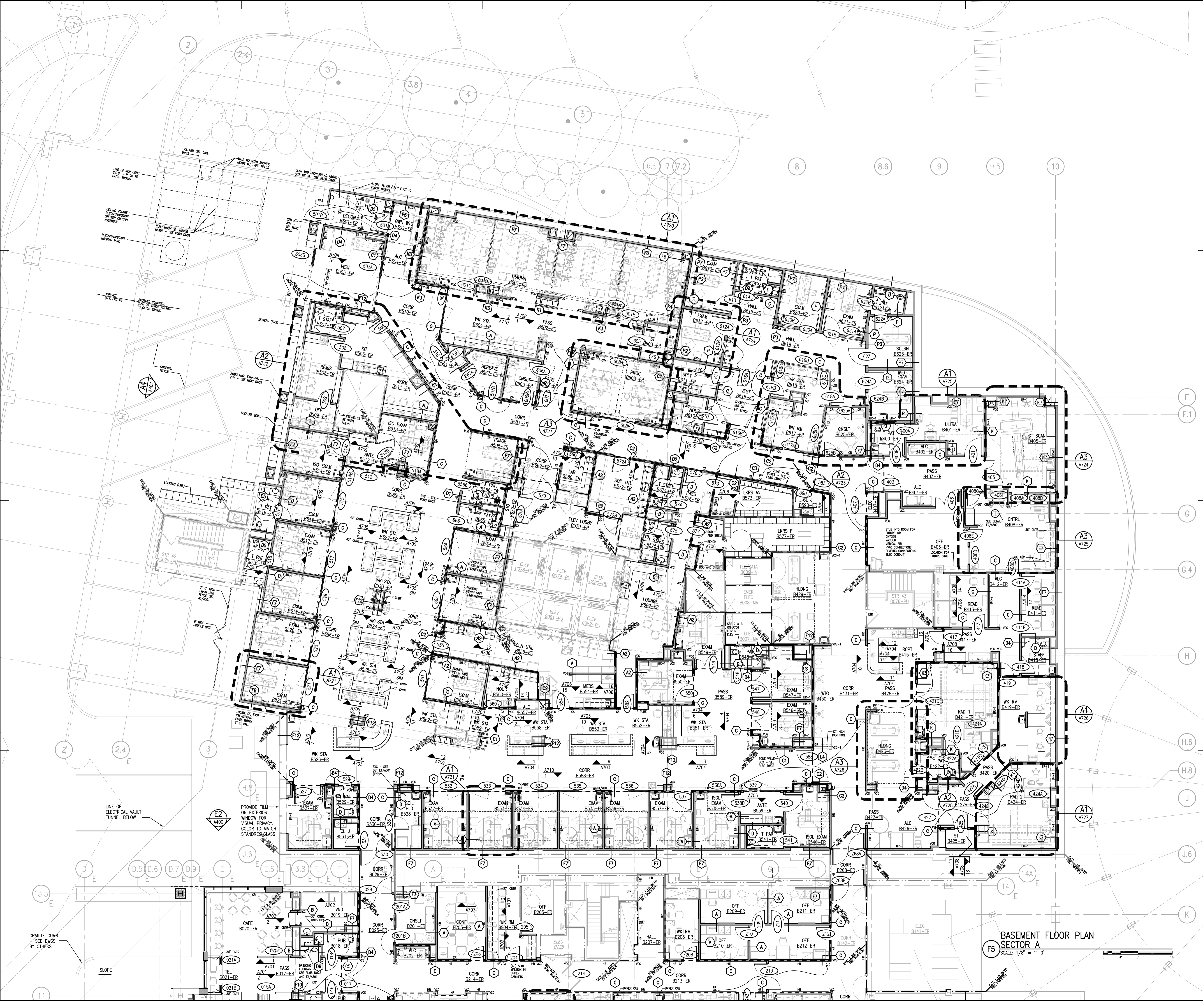
BASEMENT FLOOR PLAN SECTOR A SCALE: 1/8" = 1'-0"