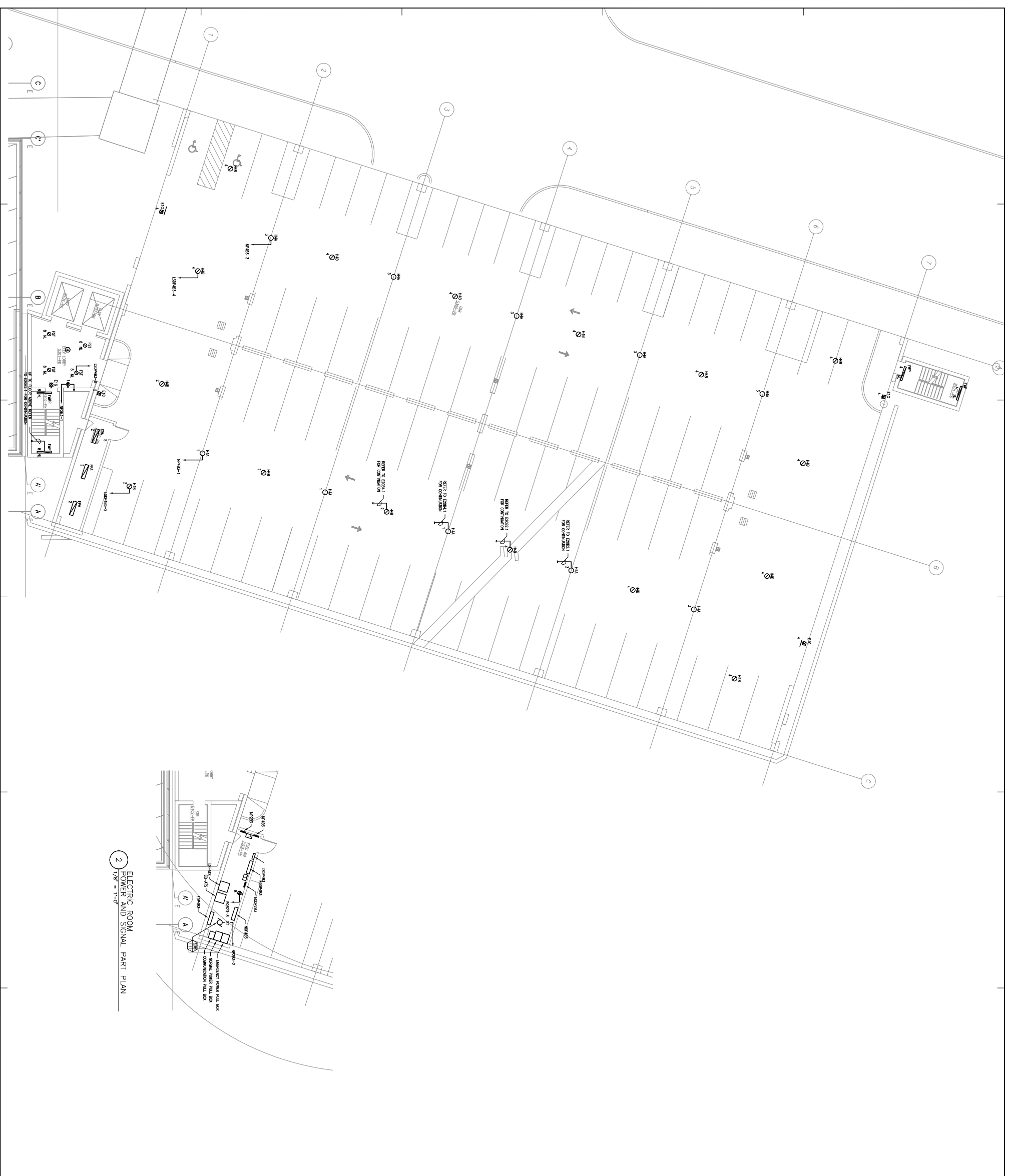
2 ELECTRIC ROOM POWER AND SIGNAL PART PLAN 1/8" = 1'-0"