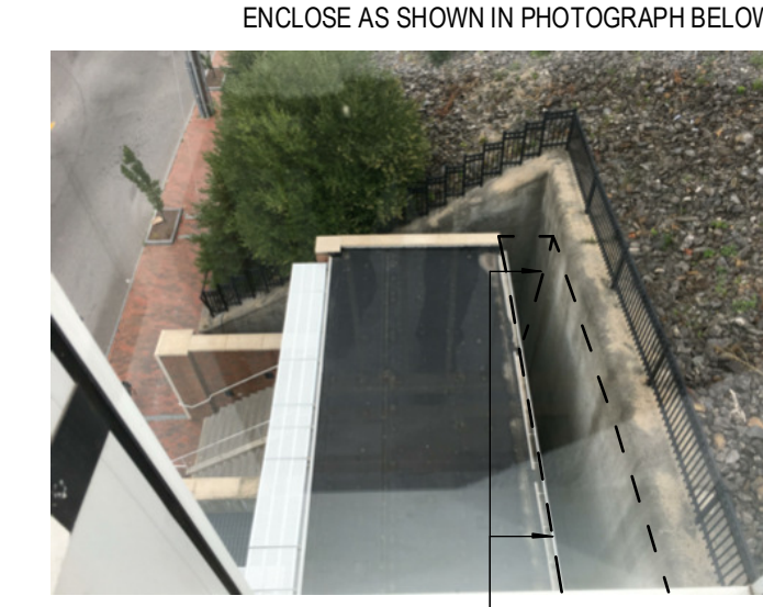
VERTICAL SCREENING WITH BACKUP SUPPORT AT EDGE OF STAIR ENCLOSURE (ALTERNATE #2) HORIZONTAL SCREENING (WITH VERTICAL SUPPORT COLUMNS) ALIGNED WITH TOP OF STAIR ROOF (ALTERNATE #2)