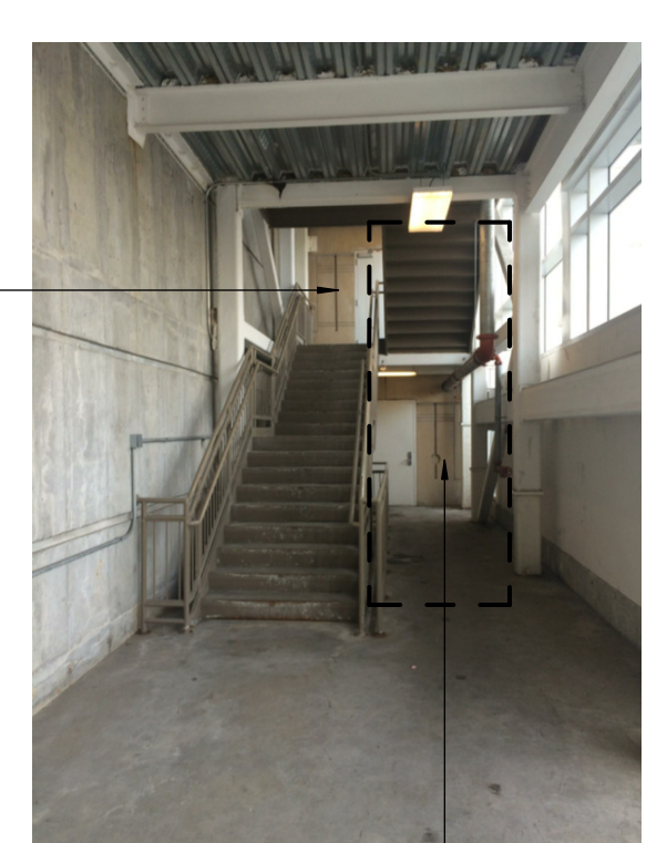
SCREENING TO PREVENT ACCESS TO SPACE UNDER STAIR WITH THE FOLLOWING ATTRIBUTES: GALVANIZED METAL MESH AND TUBE SUPPORT, HINGED GATE WITH PANIC BAR TIED TO FIRE ALARM (HW SET #13), SEAL OFF SPACE UNDER BOTTOM RUN OF STAIRS, ANCHOR MAJOR SUPPORT TO VERTICAL STEEL TUBES AND PREVENTING CLIMBER FROM STAIRDOWN TO FLOOR SPACE (ALTERNATE #2)