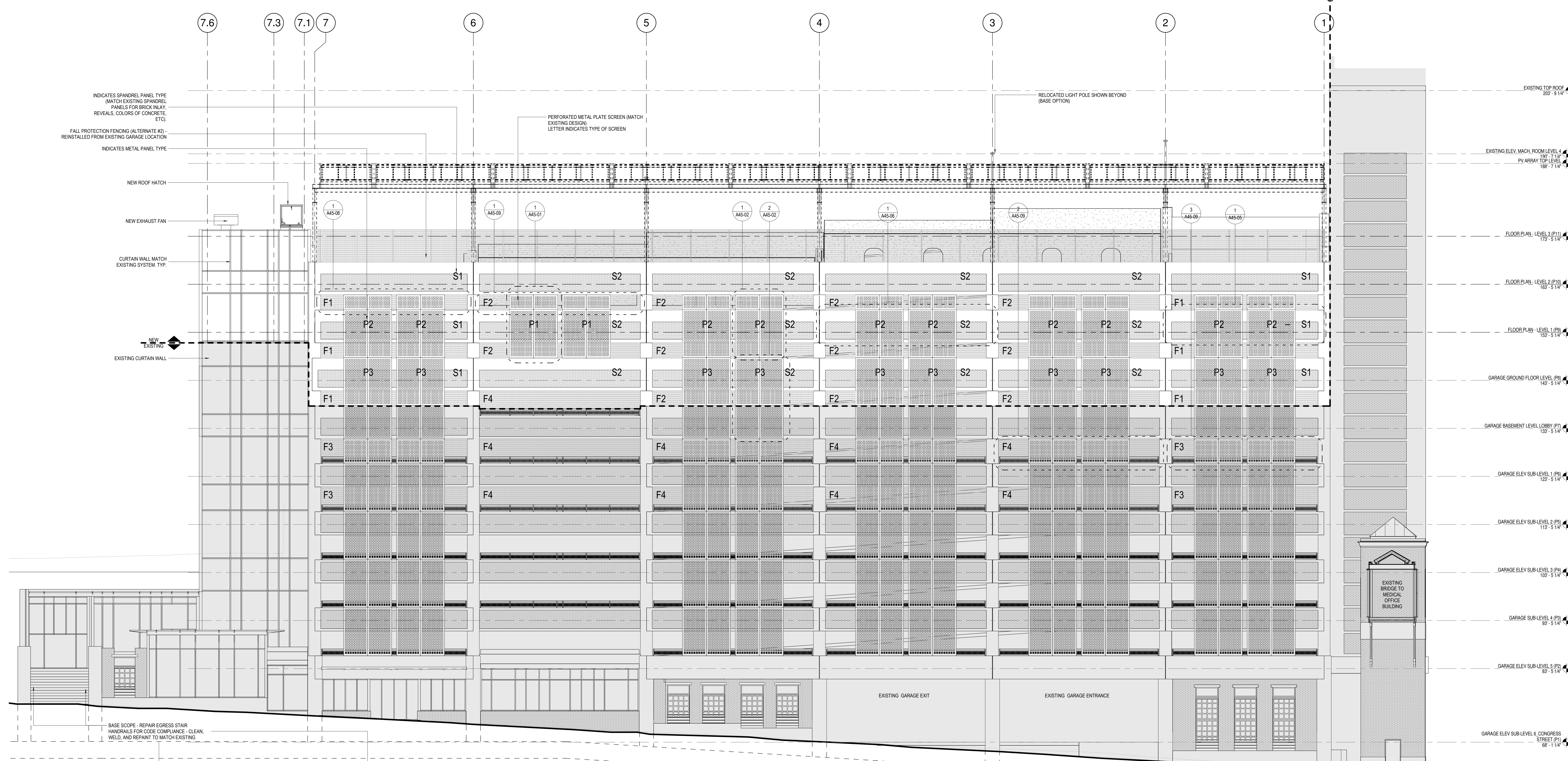
1 NORTH - ELEVATION 1/8" = 1'-0"