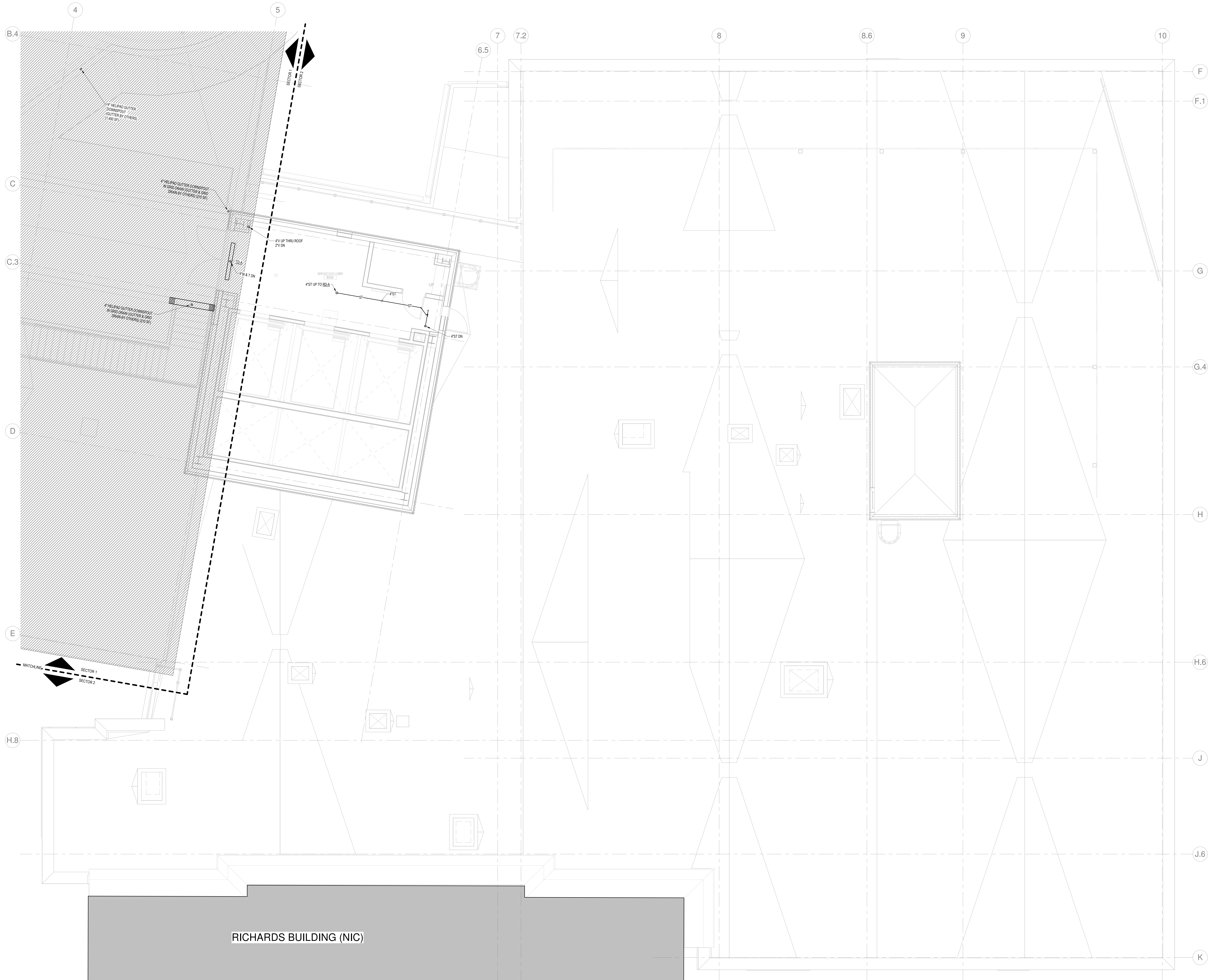
1 PENTHOUSE - SECTOR 2 SCALE: 1/4" = 1'-0"

3/29/2018 11:46:08 AM C:\Revit Local Files_B150312\000\MDC East Tower 6&7 MEP17_Constr.plumbing.rvt