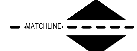
1 LEVEL 7 - SECTOR 1 SCALE: 1/4" = 1'-0"

3/29/2018 11:16:18 AM C:\Revit Local Files_B150312\000\MDC East Tower 6&7 MEP17_Constr.dwg