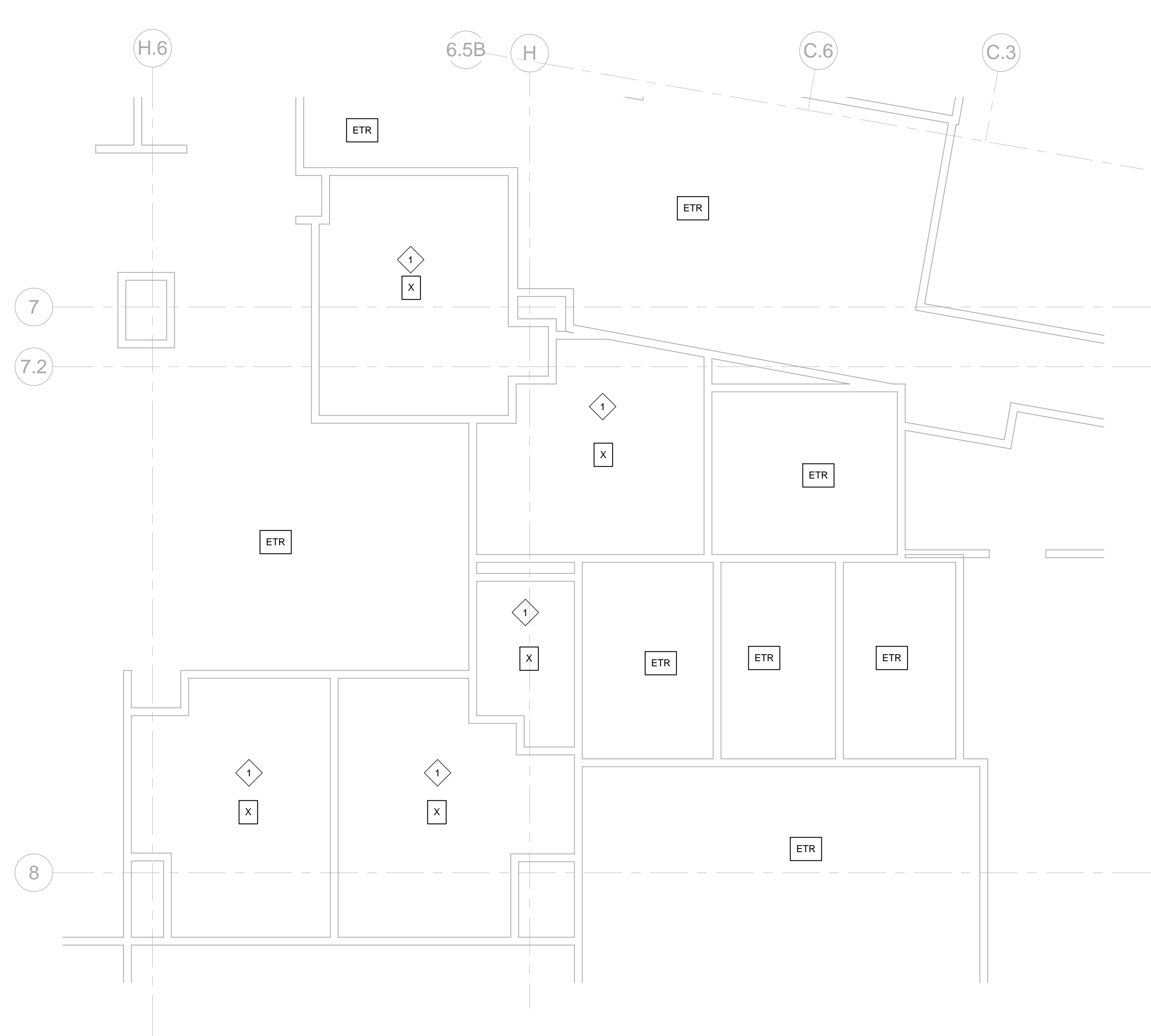
1 FIRST FLOOR FIRE PROTECTION DEMO CEILING F1.0 1/4" = 1'-0"

1 EXTEND 1" SPRINKLER PIPE FROM EXISTING BRANCH, PROVIDE SWING ARM-OVER AND CONNECT TO NEW SPRINKLER. COORDINATE WITH ALL CEILING MOUNTED EQUIPMENT.