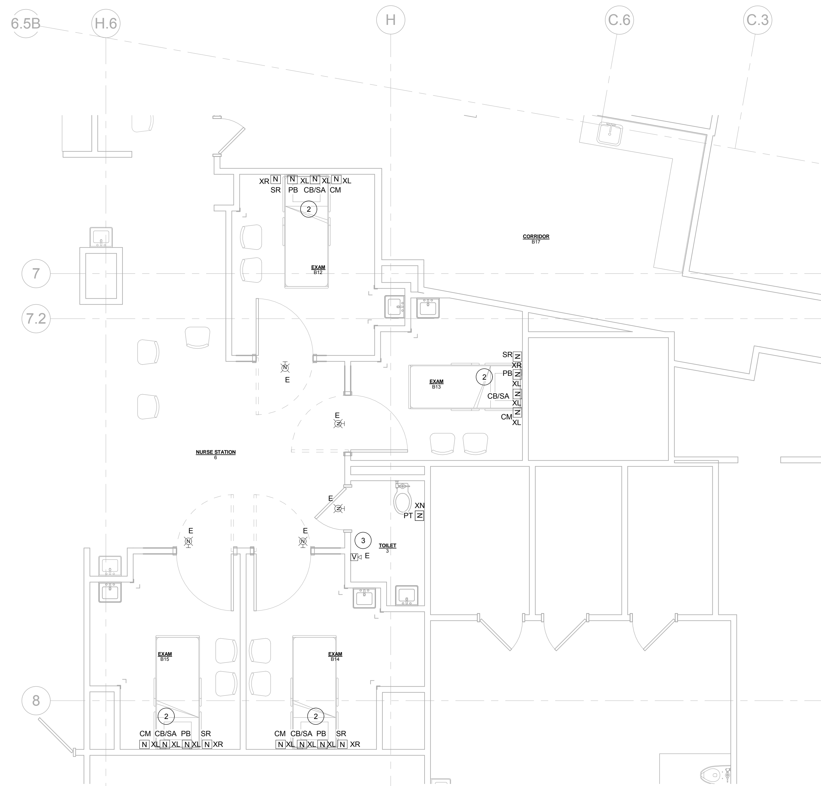
2 Electrical First Floor Signal Plan 1/4" = 1'-0"