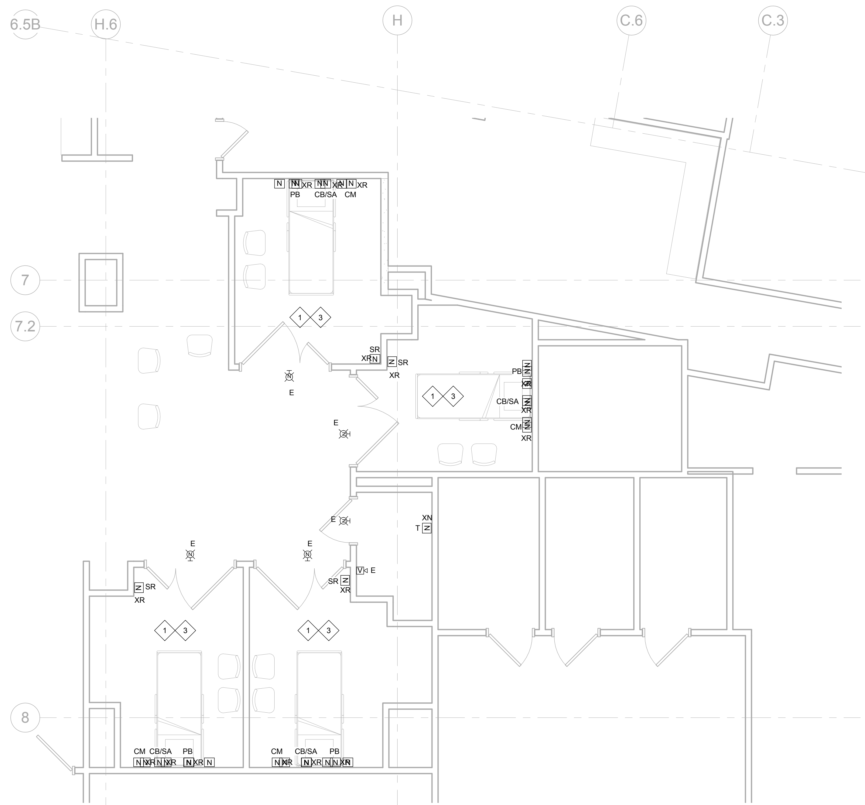
1 Electrical First Floor Demolition Signal Plan 1/4" = 1'-0"