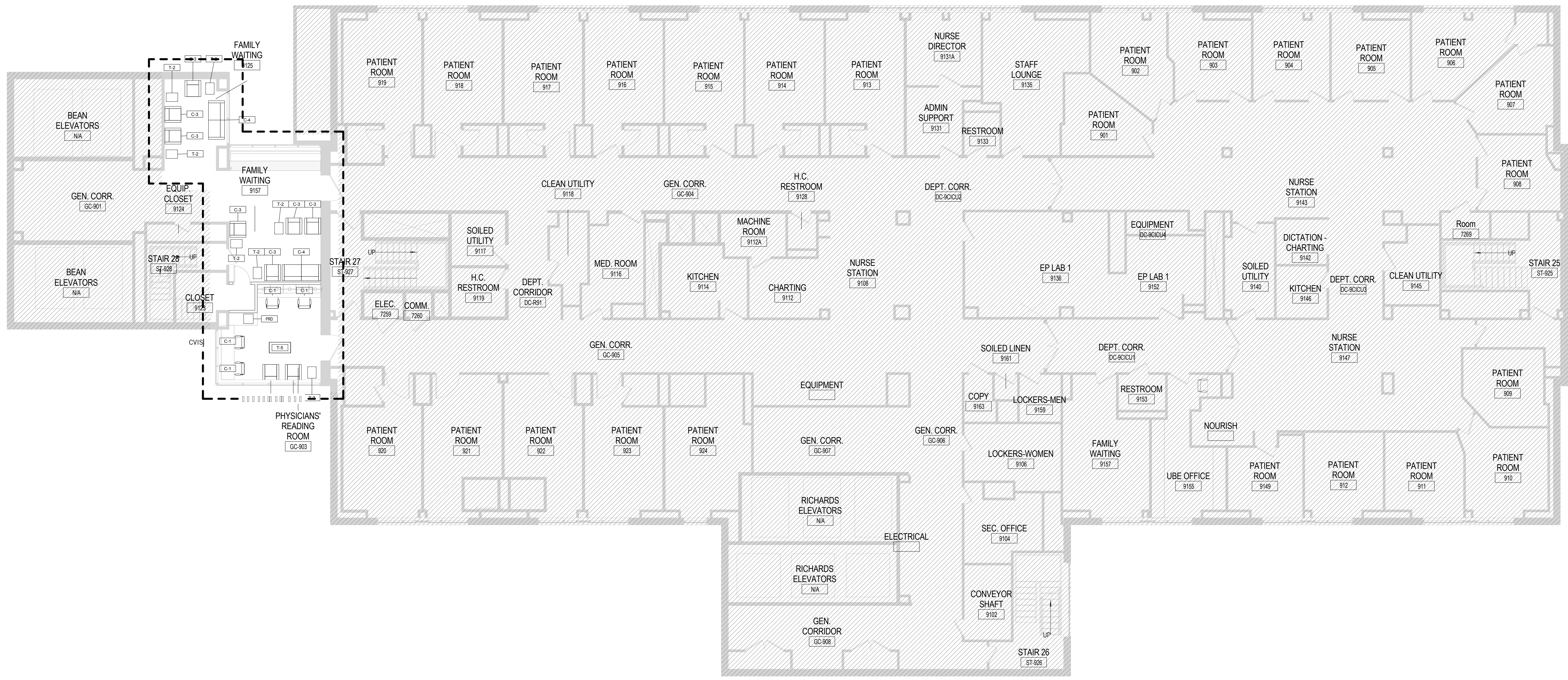
1 RICHARDS 9 FFE PLAN 1/8" = 1'-0"