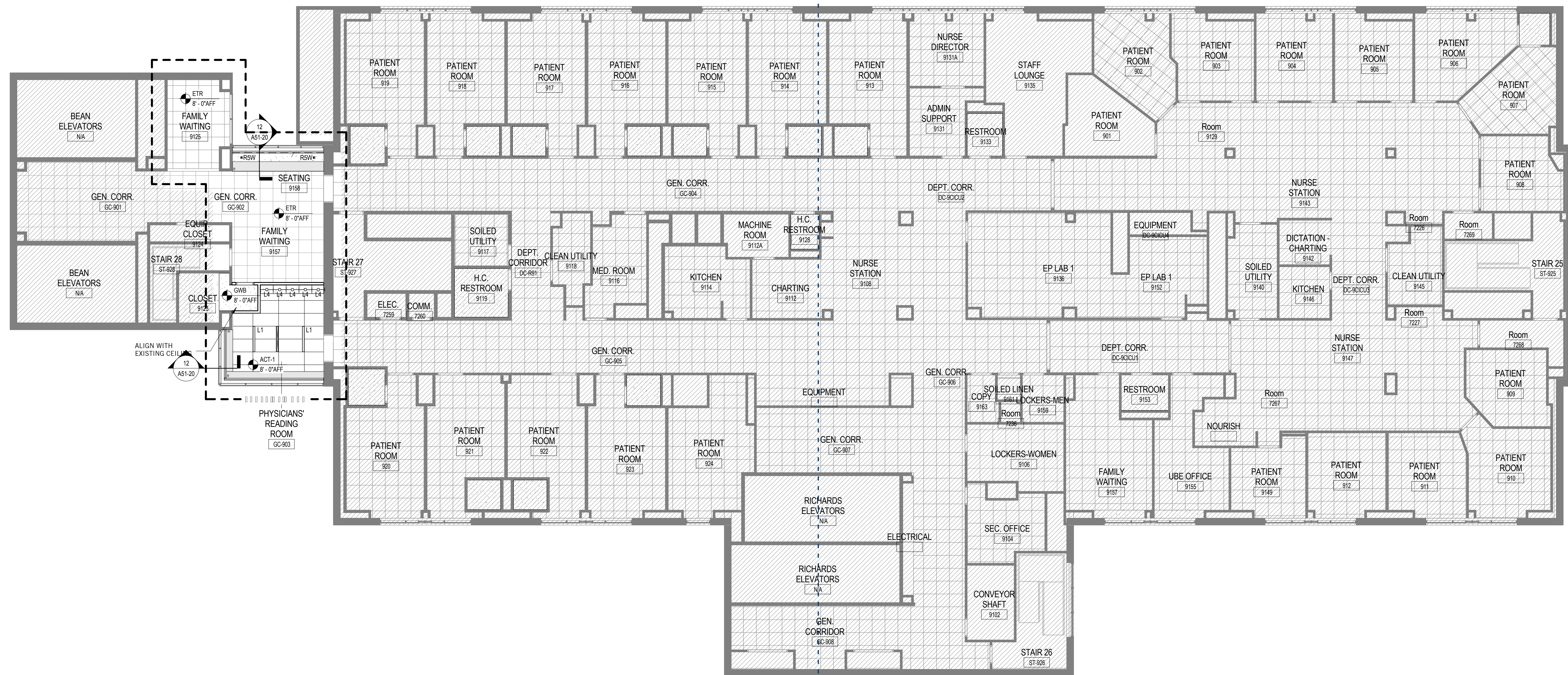
1 RICHARDS 9 RCP 1/8" = 1'-0"