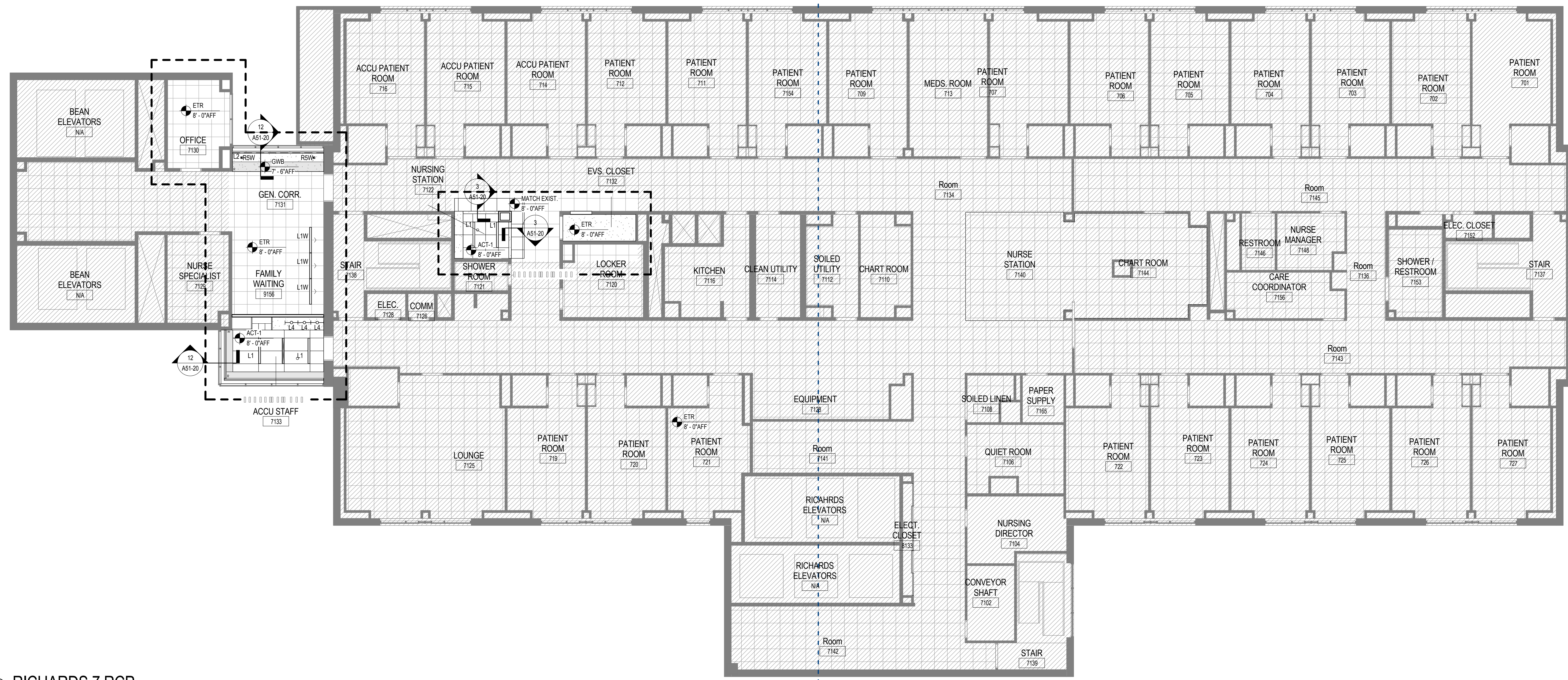
1 RICHARDS 7 RCP 1/8" = 1'-0"