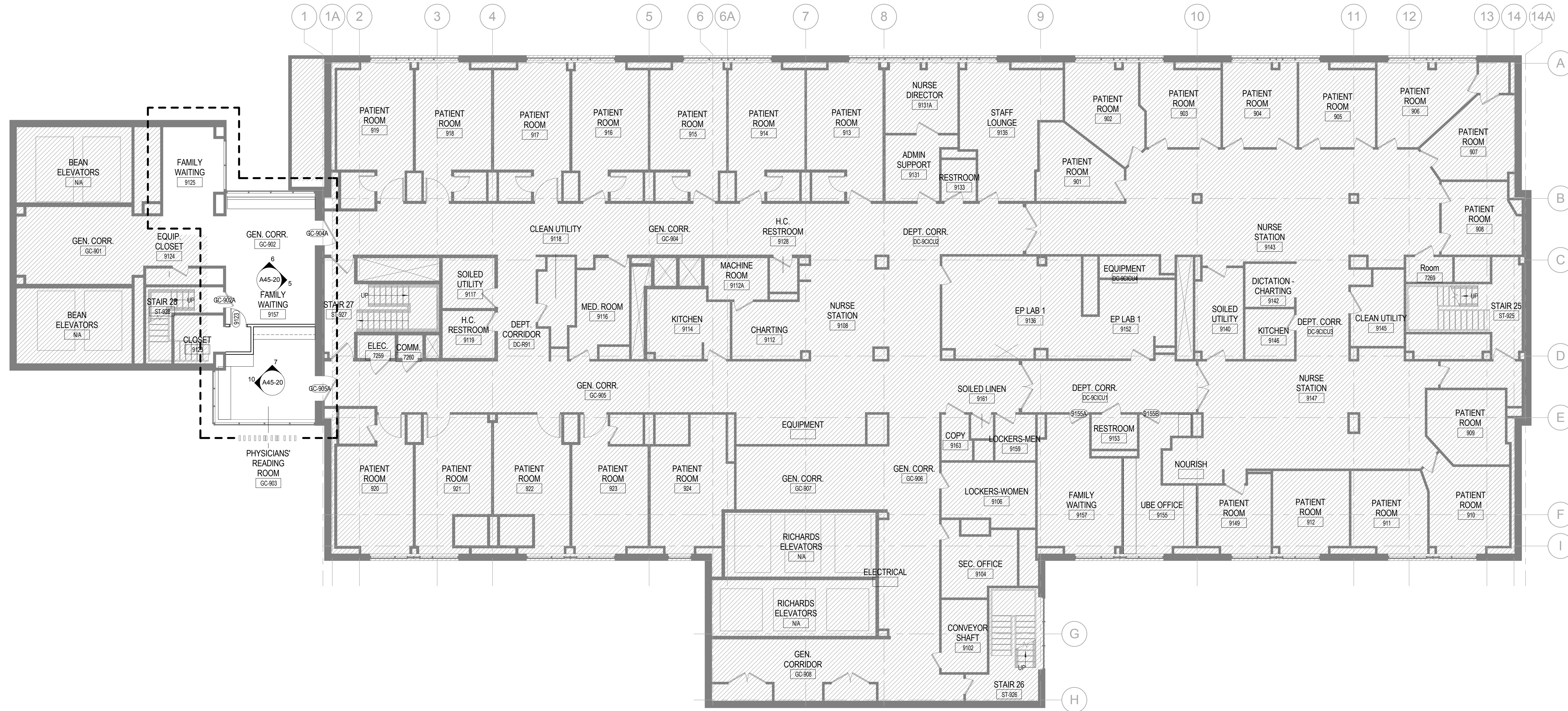
1 RICHARDS 9 1/8" = 1'-0"