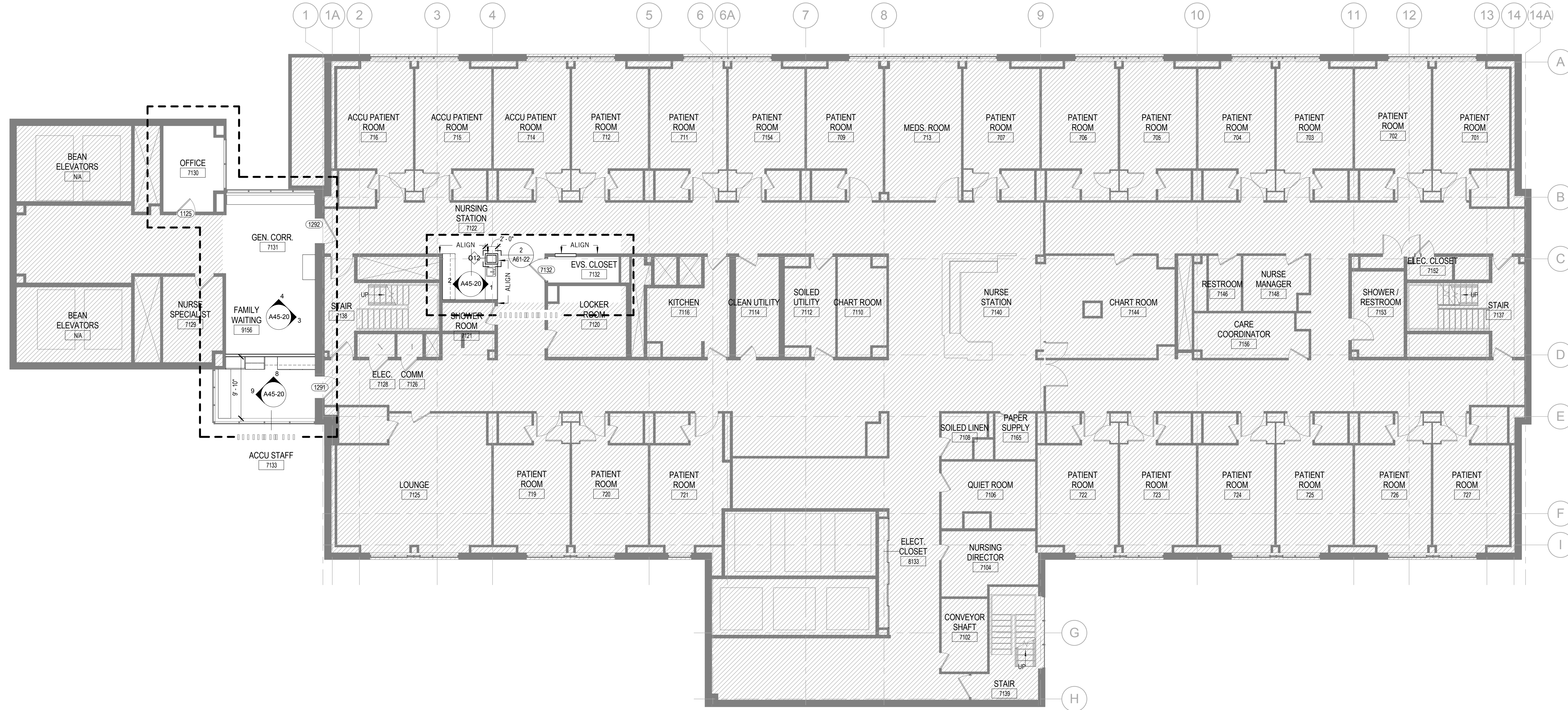
1 RICHARDS 7 1/8" = 1'-0"