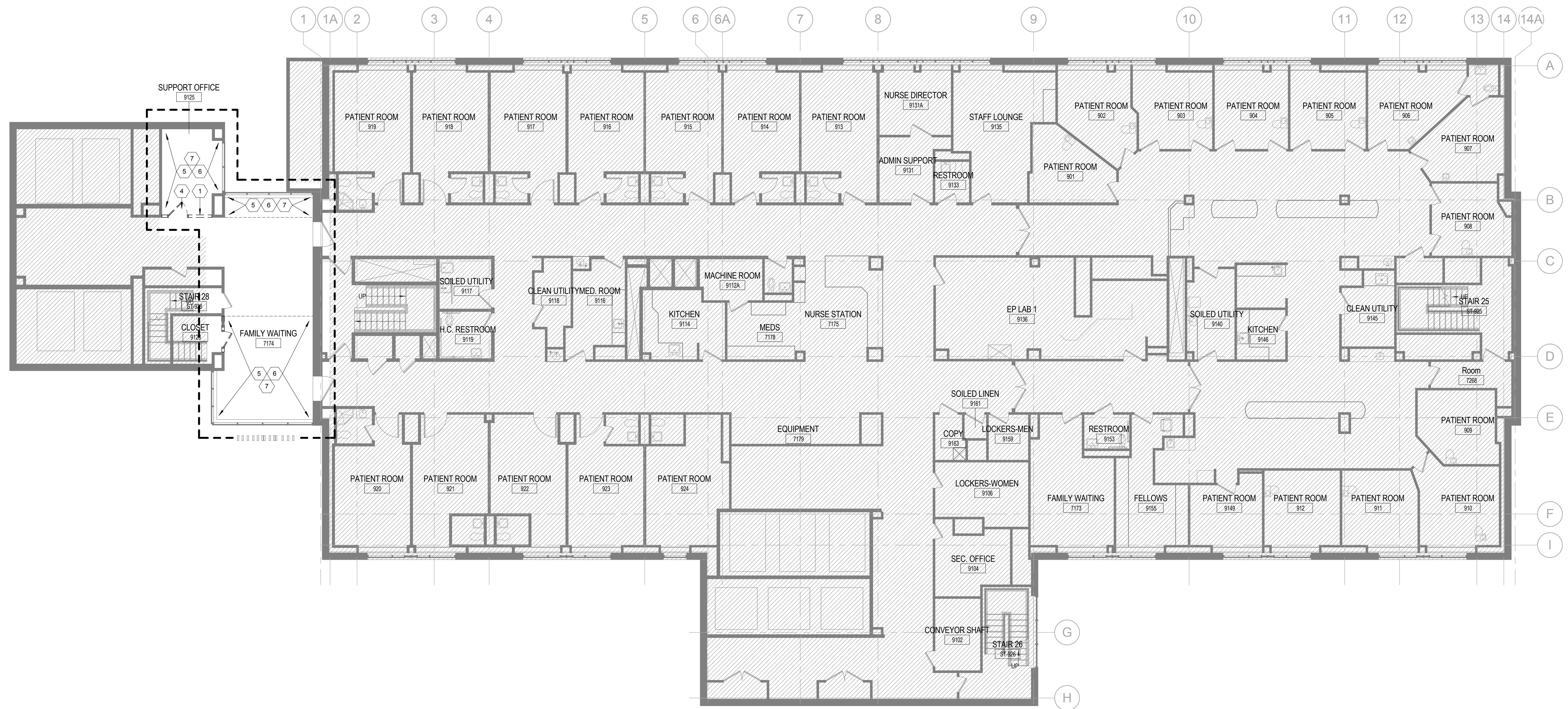
1 DEMOLITION PLAN RICHARDS 9 1/8" = 1'-0"