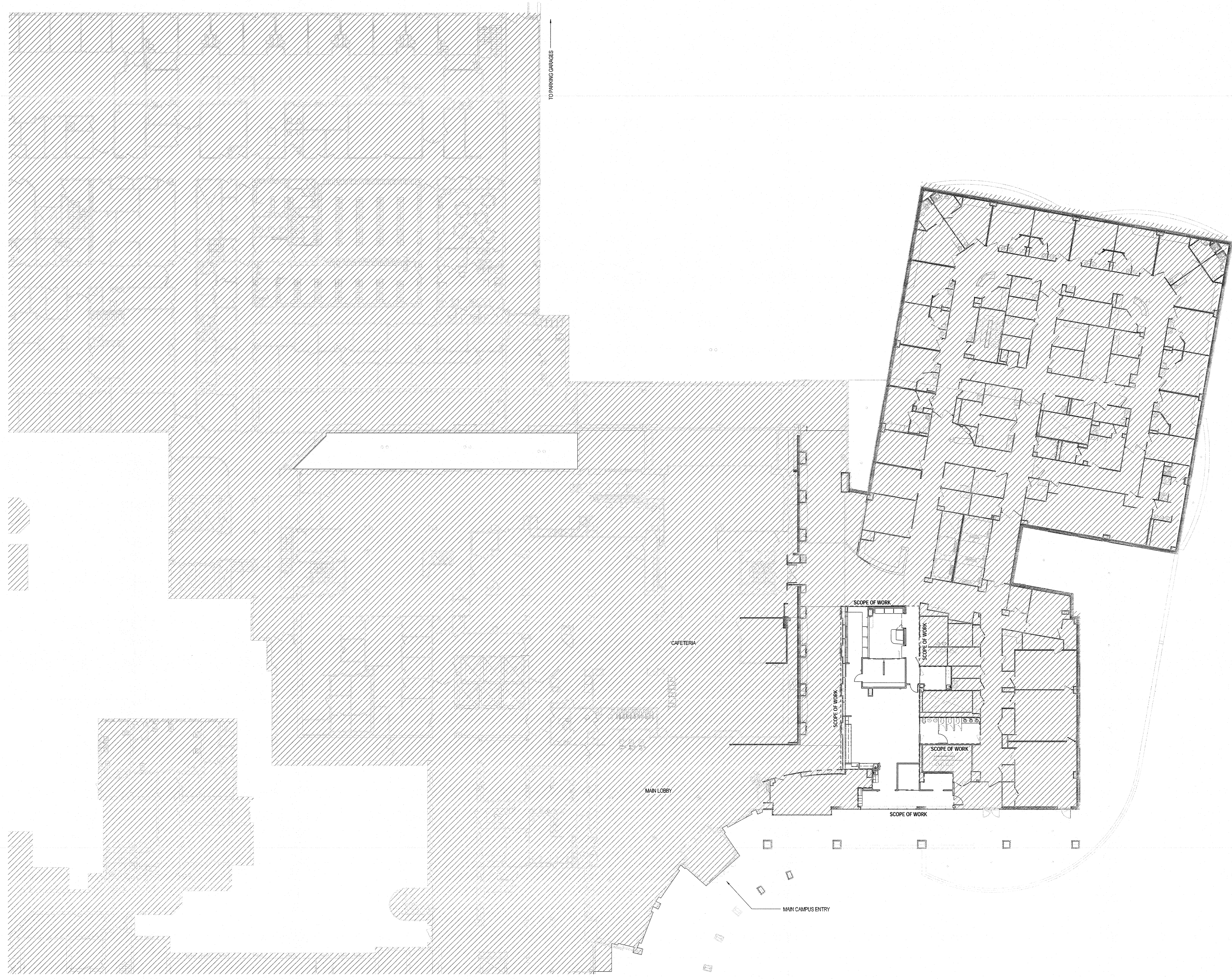
1 GROUND LEVEL - OVERALL FLOOR PLAN 1/16" = 1'-0"