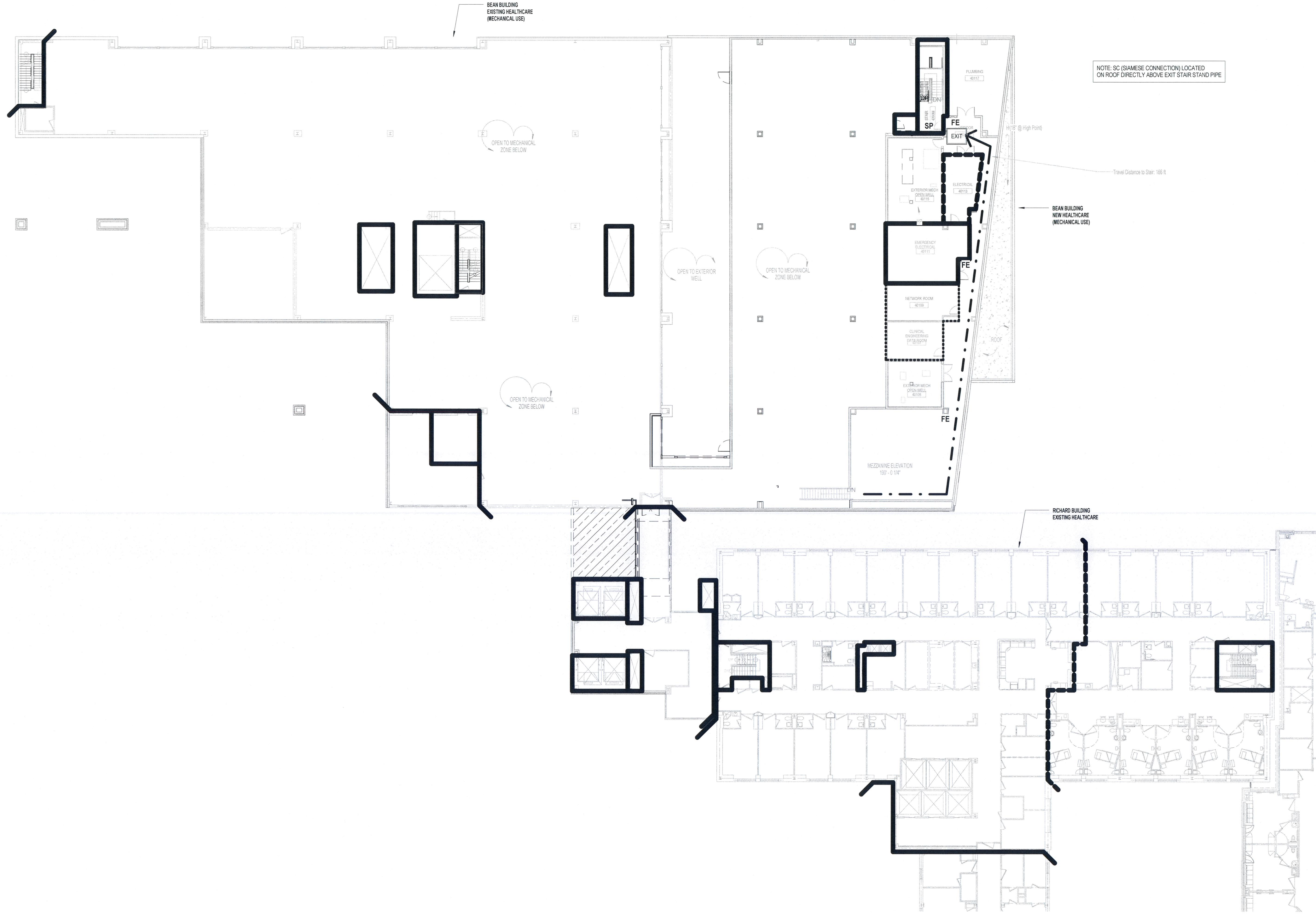
1 LIFE SAFETY LEVEL 4 MEZZ PLAN 1/16" = 1'-0"