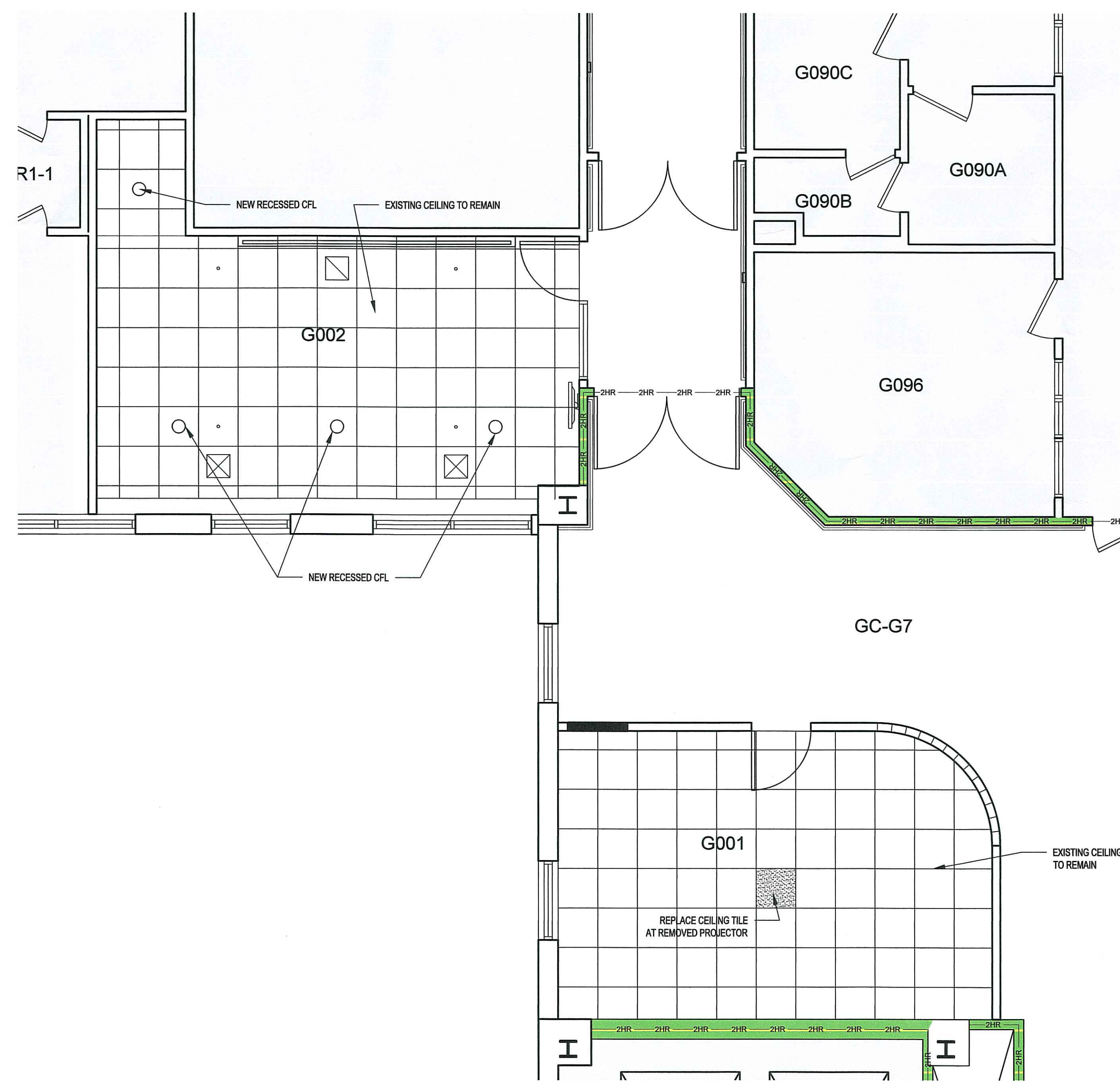
2 REFLECTED CEILING PLAN - NEW WAITING ROOMS 1/4"=1'-0"