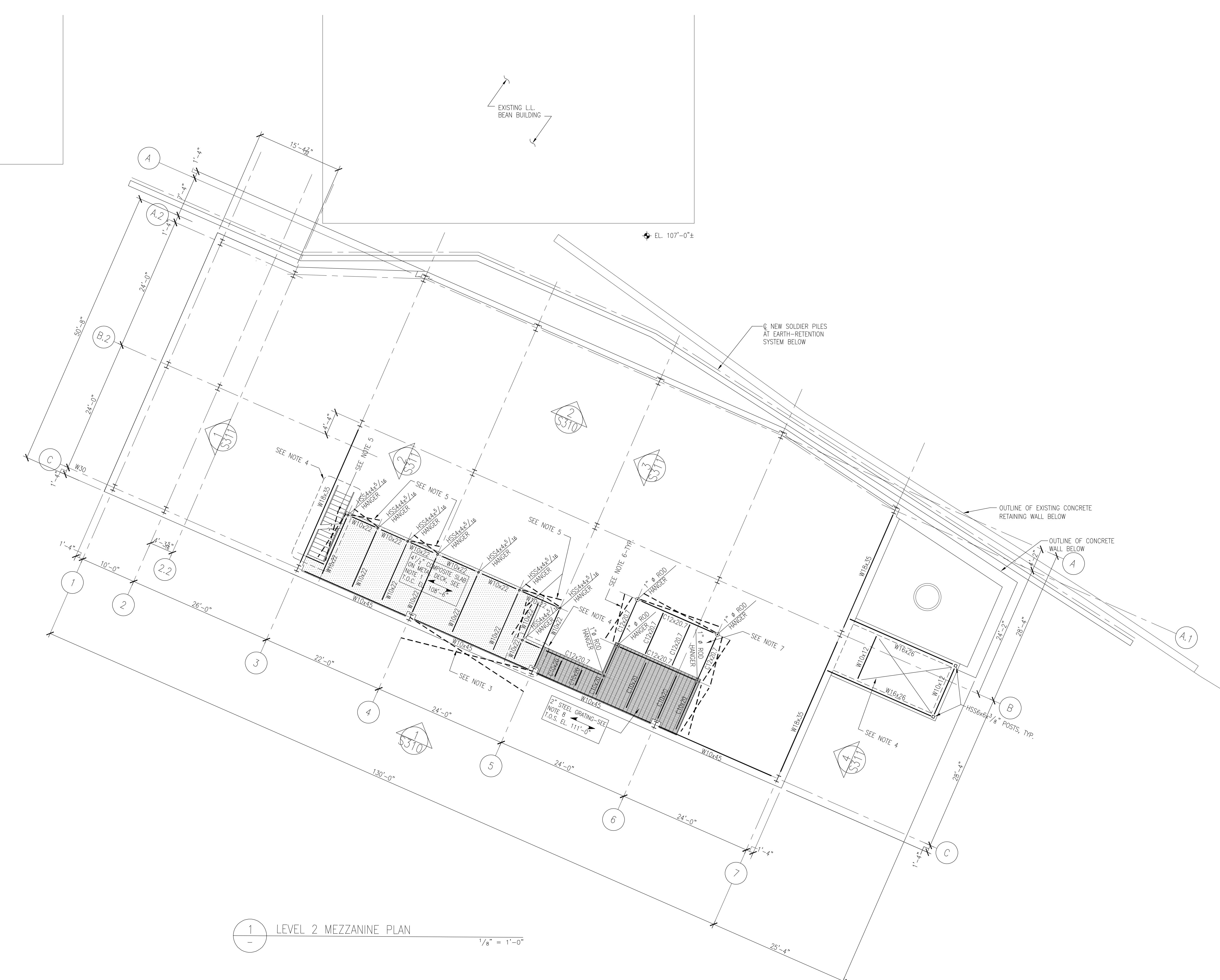
1 LEVEL 2 MEZZANINE PLAN 1/8" = 1'-0"