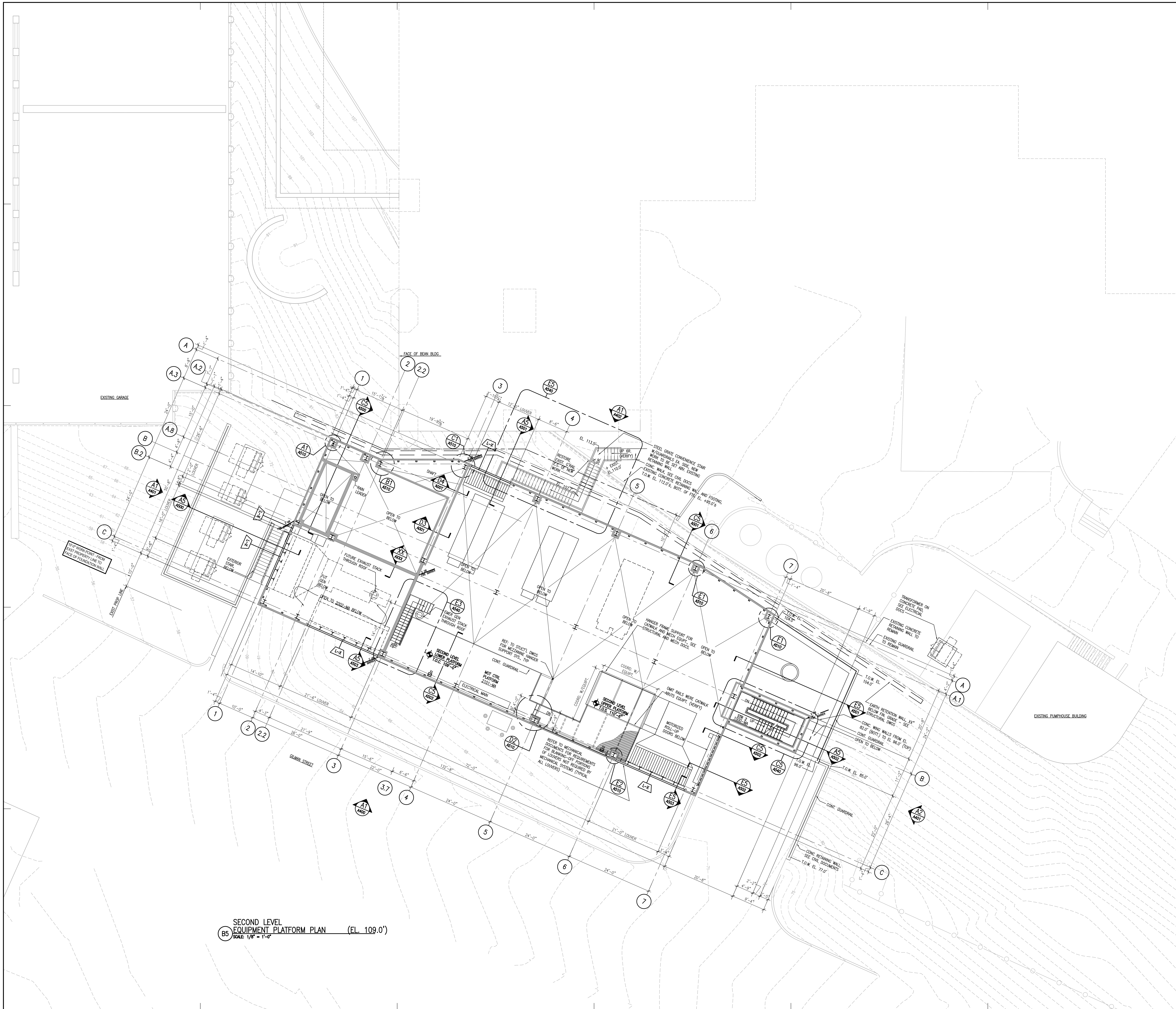
SECOND LEVEL EQUIPMENT PLATFORM PLAN (EL. 109.0') B5 SCALE: 1/8" = 1'-0"