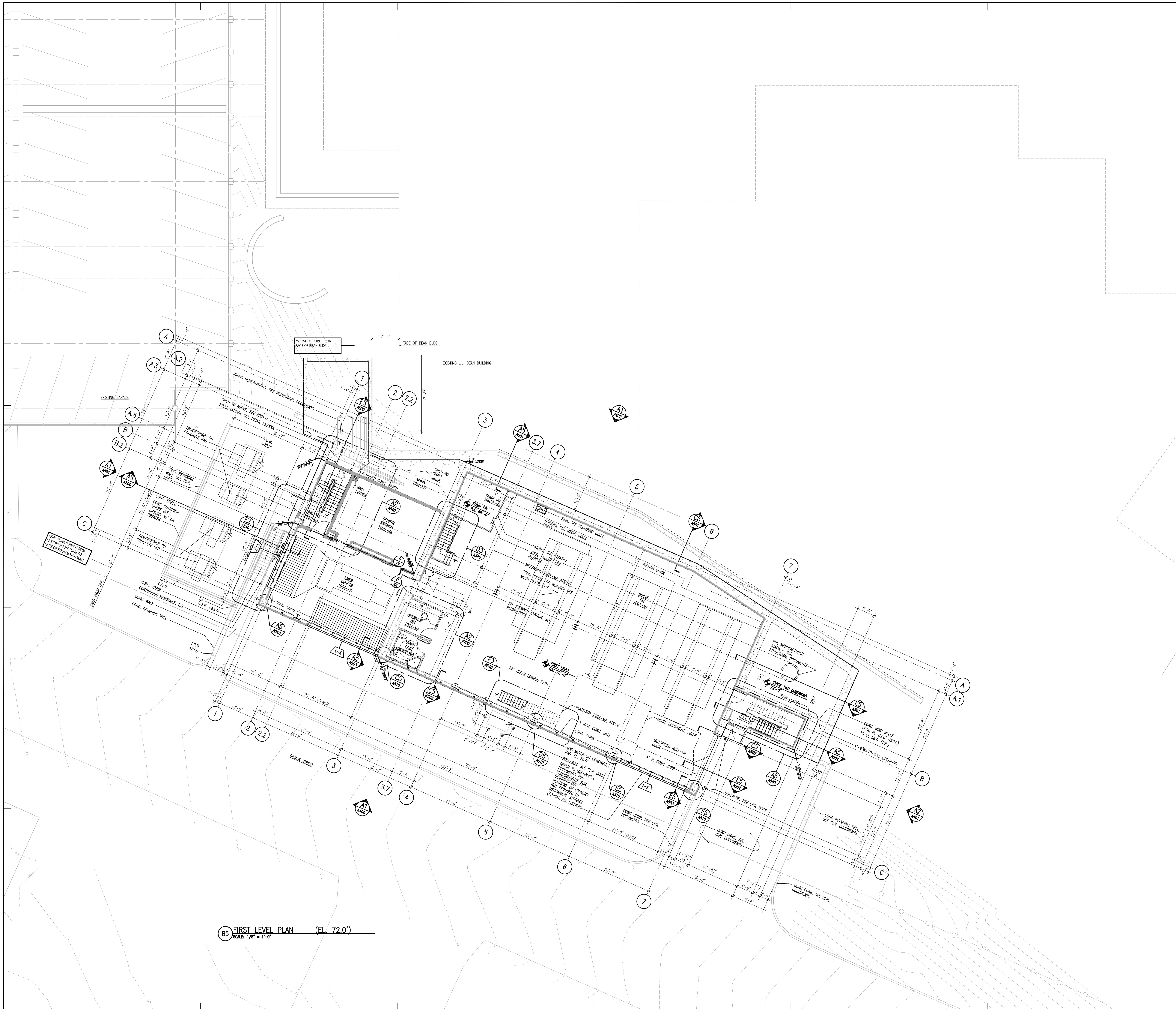
B5 FIRST LEVEL PLAN (EL. 72.0') SCALE: 1/8" = 1'-0"