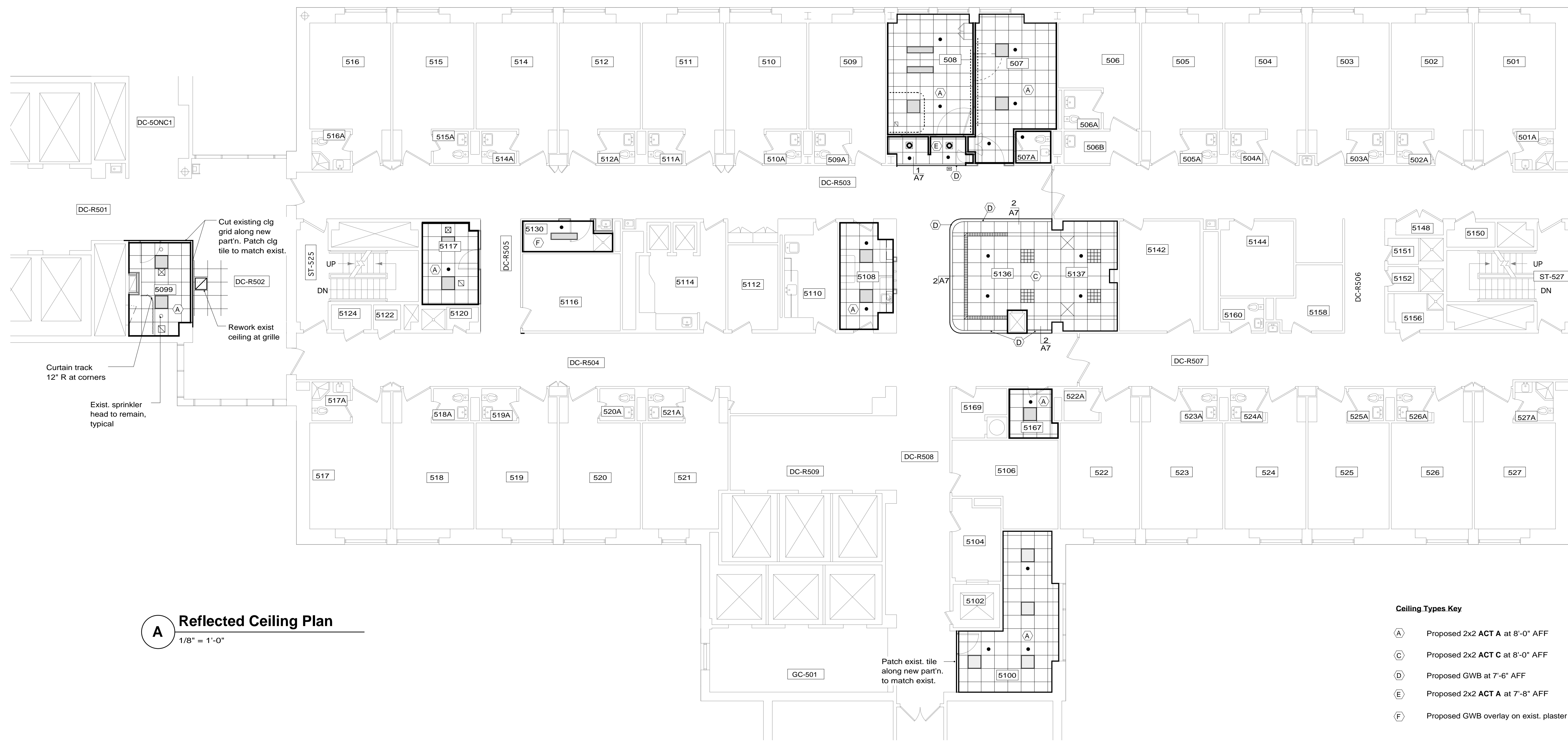
A Reflected Ceiling Plan 1/8" = 1'-0"