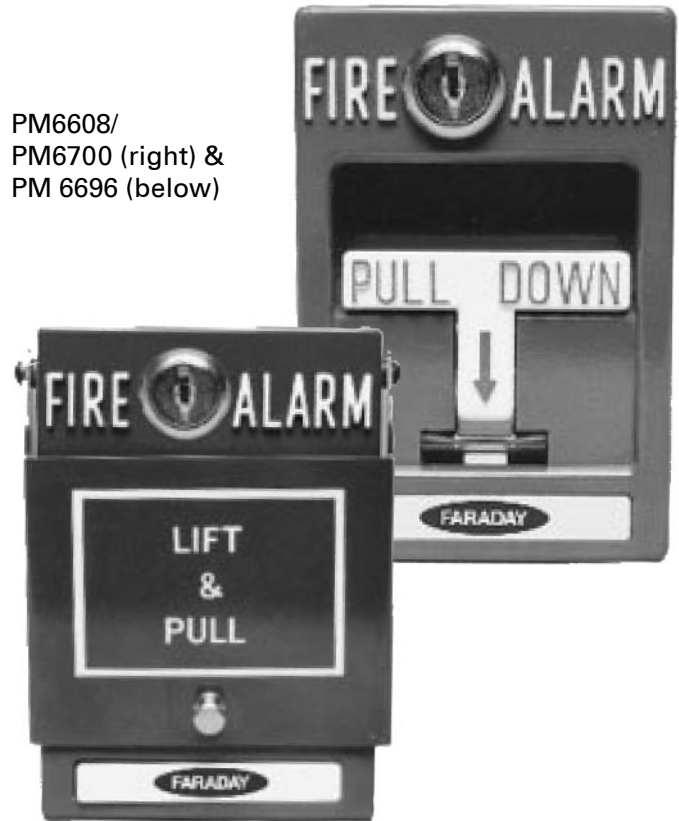
PM6608/ PM6700 (right) & PM 6696 (below)

This lets the front of the station swing down and allows the recessed pull down lever to be reset in the normal up position. Replacement of the glass rod (if used) is not necessary to reset the station. However, spare glass rods can be stored inside the station. To lock the station swing the front of the station back up to its original position and turn the MM101 key in the previously operated position.