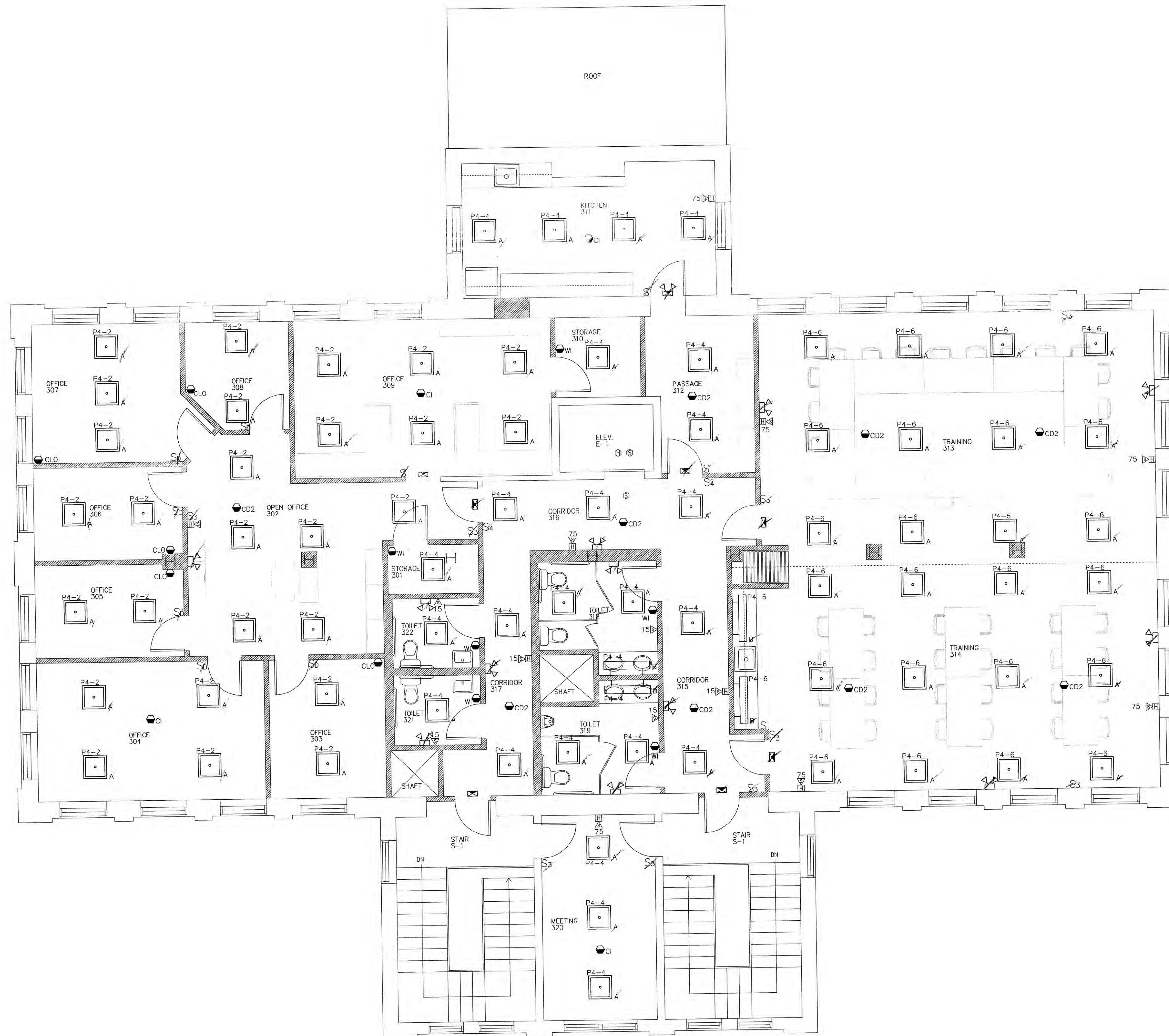
1 THIRD FLOOR ELECTRICAL LIGHTING AND FIRE ALARM PLAN SCALE: 1/4"=1'

NOTES: 1. SEE E.O.0 FOR LEGEND, ABBREVIATIONS AND GENERAL NOTES. KEYED NOTES: ① ***