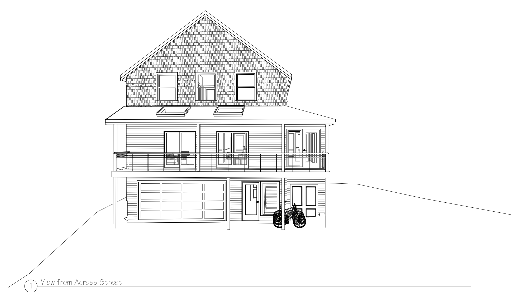
① View from Across Street