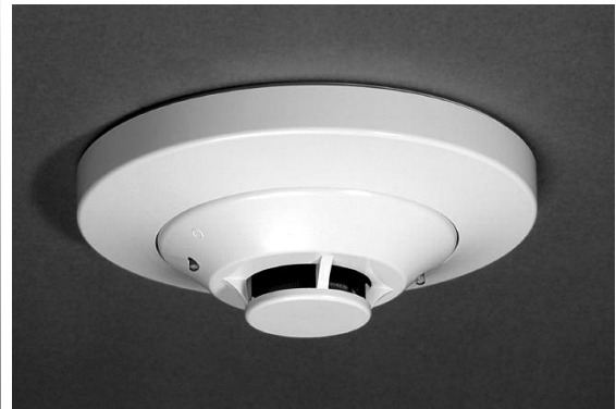
IDP-Photo (Base not Included)