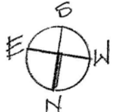
Site Plan 1" = 20'-0"

Brazell Residence Unit B 276 State Street, Unit B Portland ME 04102