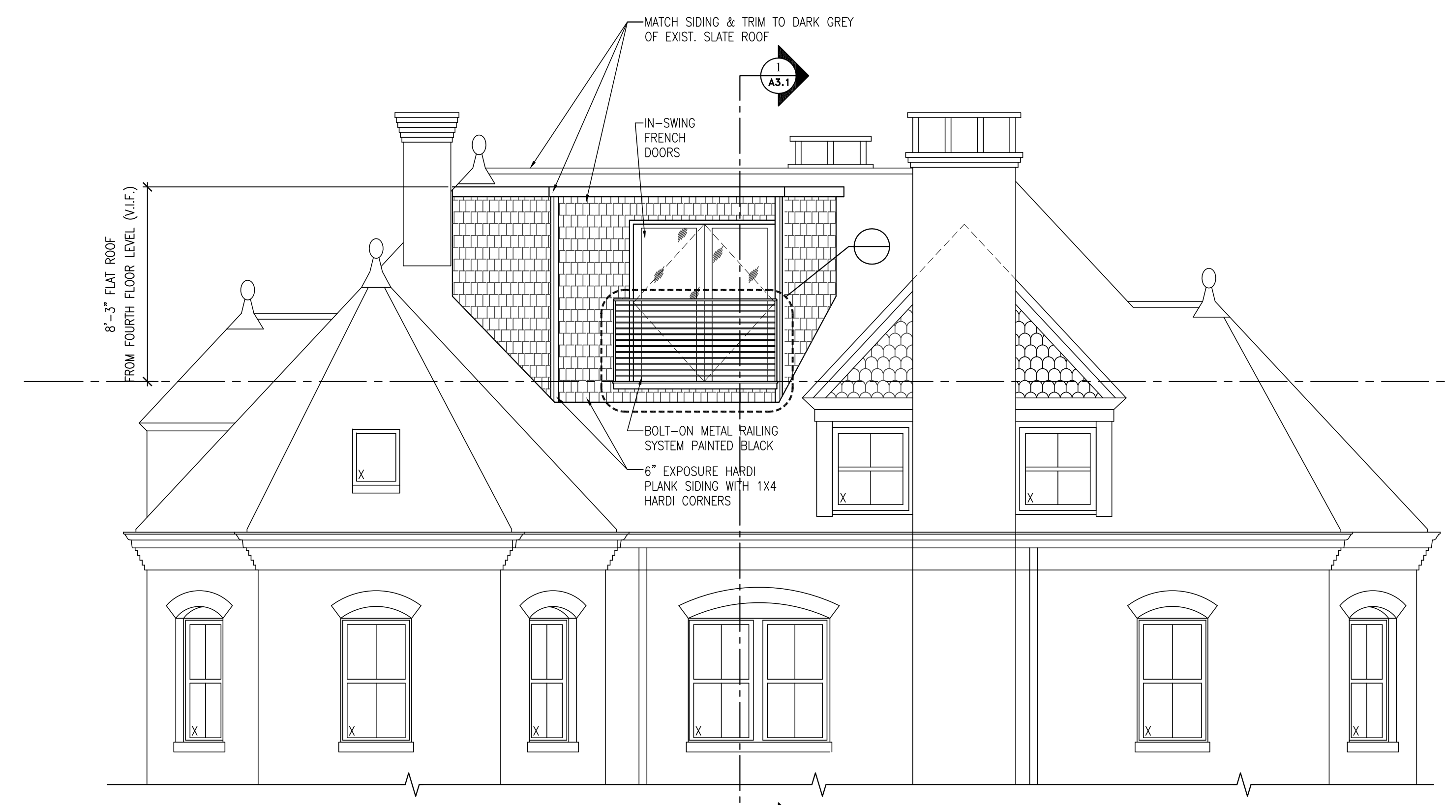
1 DRIVEWAY ELEVATION (SOUTH) SCALE: 1/4" = 1'-0"