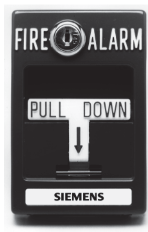
Standard Model Or Weatherproof