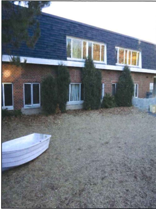
Above:: View looking northeast across play area. Former wooden play structures have been removed.