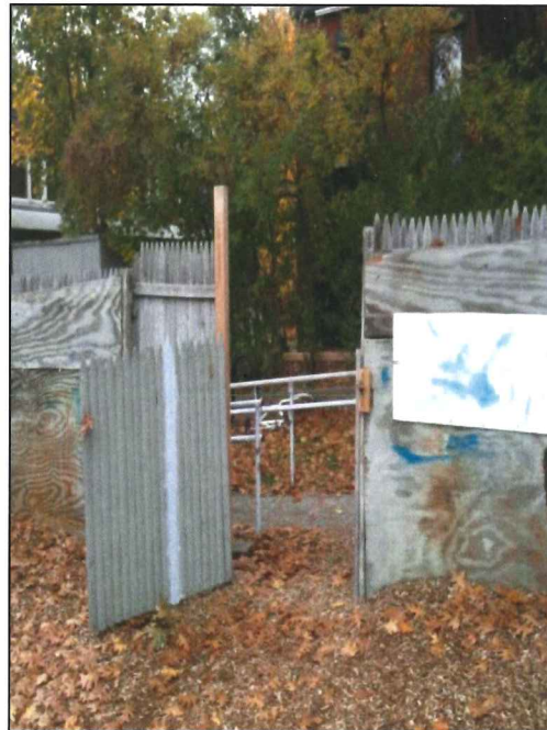
Above:: View looking east to play area entrance from sidewalk leading from parking area to rear building entrance. Fence and gate will be replaced.