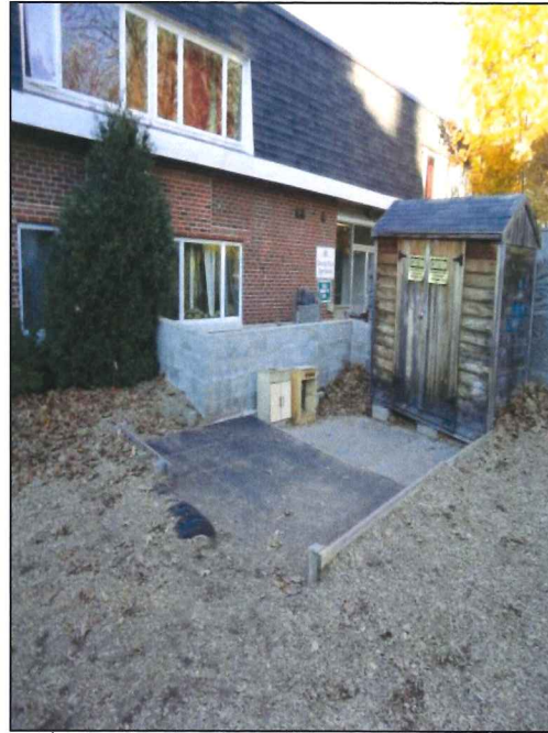
Above:: Existing shed will be reset in same location. Cinder block retaining wall, which houses existing catch basin will remain in place.