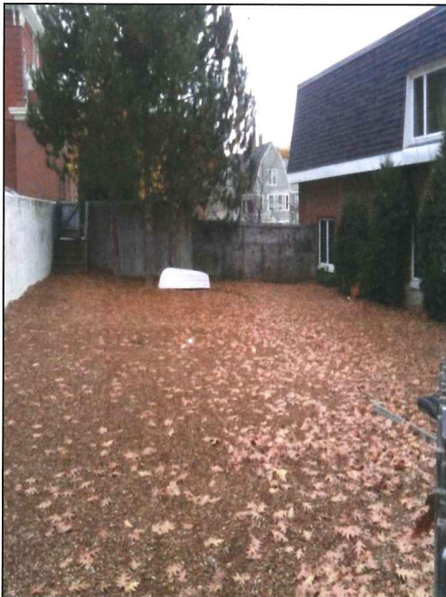
Above:: View looking northwest across play area. Stair access and existing concrete wall will remain. Fence will be replaced.