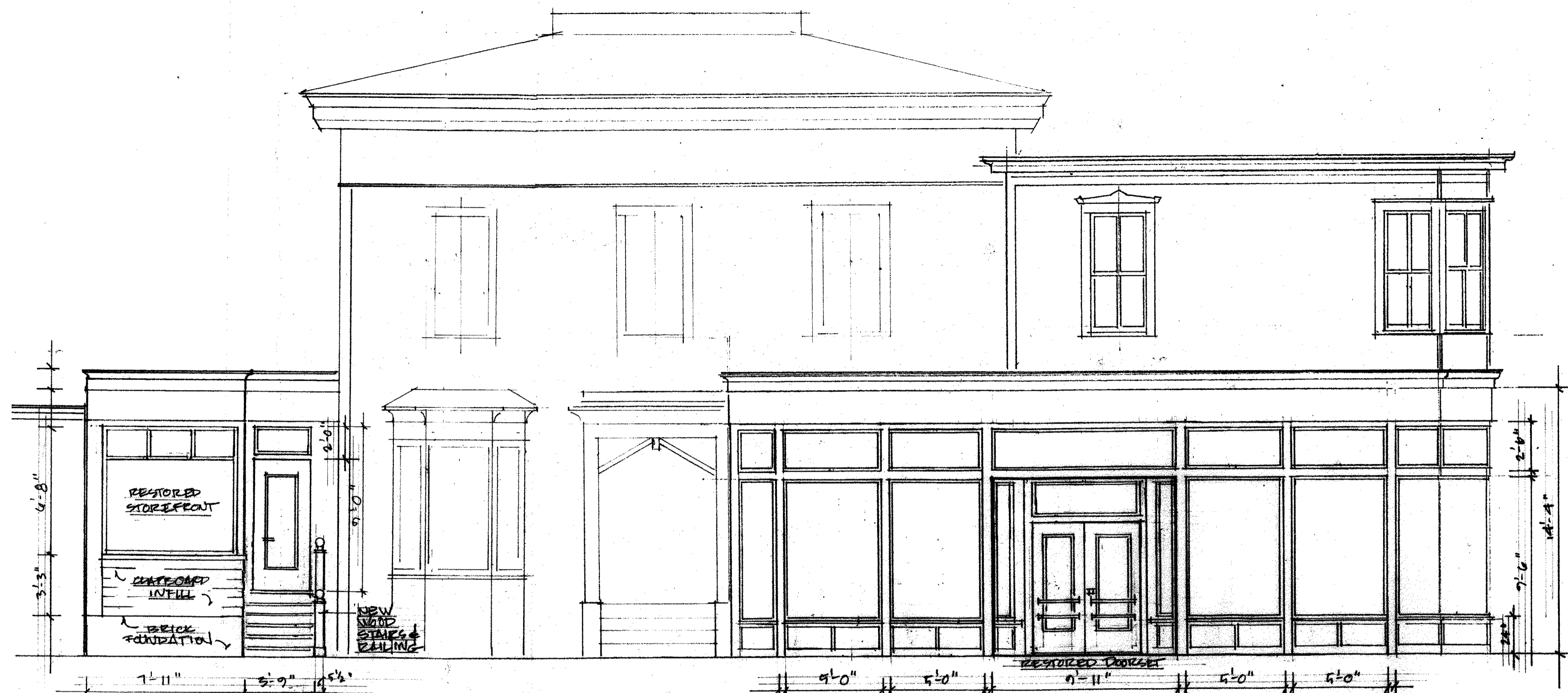
FORMER BAKERY REV. 9/9/13 2/24/14