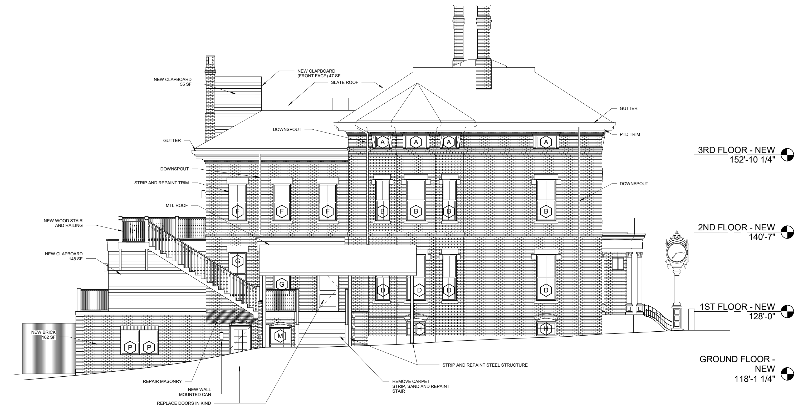
3 | NEW LEFT ELEVATION 1/8" = 1'-0"