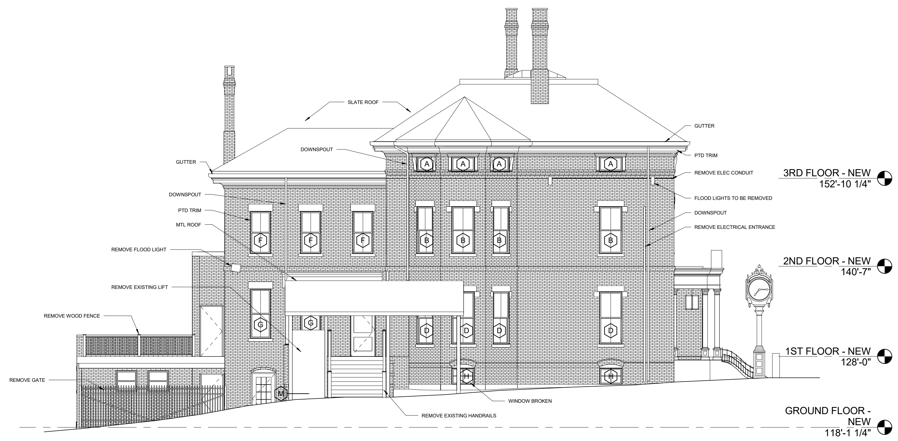
3 EXISTING LEFT ELEVATION 1/8" = 1'-0"