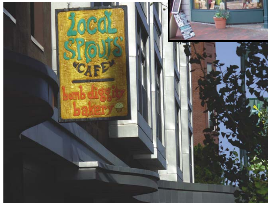
Bomb Diggity Bakery/Local Sprouts Economic Development