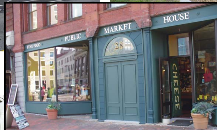
Congress Street Facade Improvements