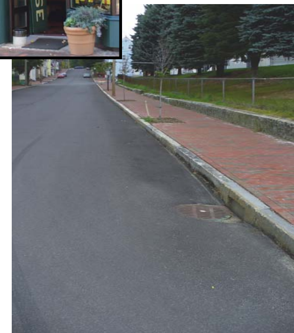
Madison Street Sidewalk and Road Reconstruction

If you would like to have any part of this brochure interpreted in your language or need a translator at any of the scheduled meetings, please contact this office at 874-8689.