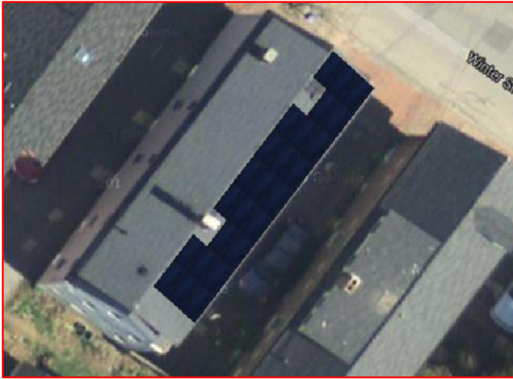
Rendering (not to scale)