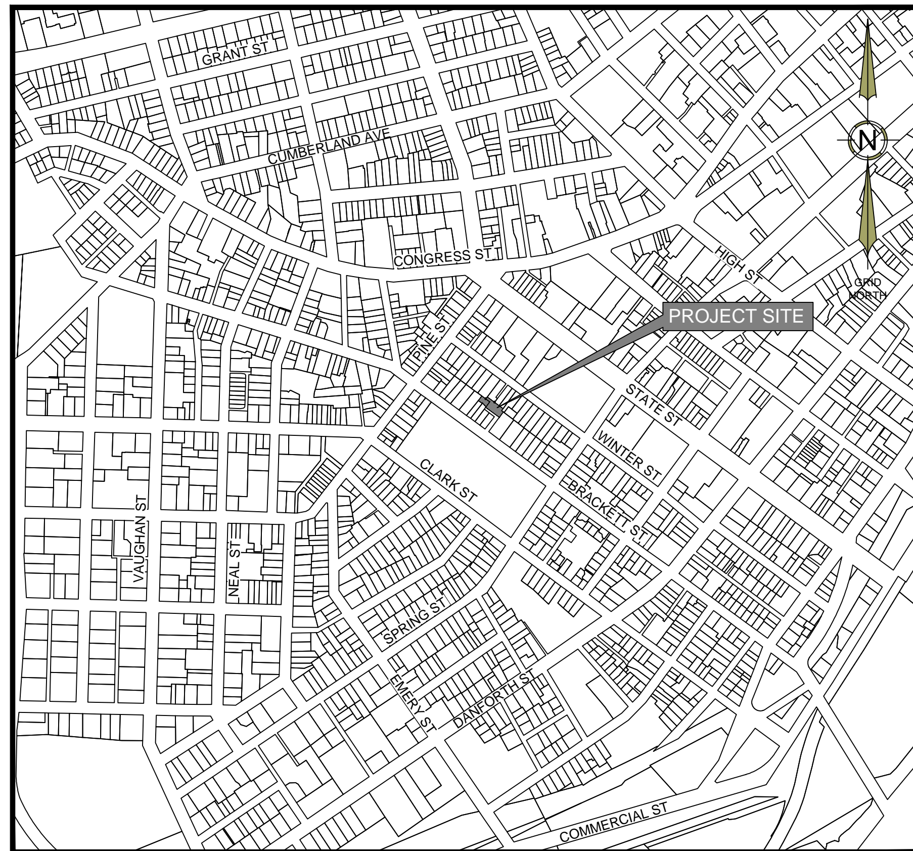
LOCATION MAP SCALE: 1"=500'