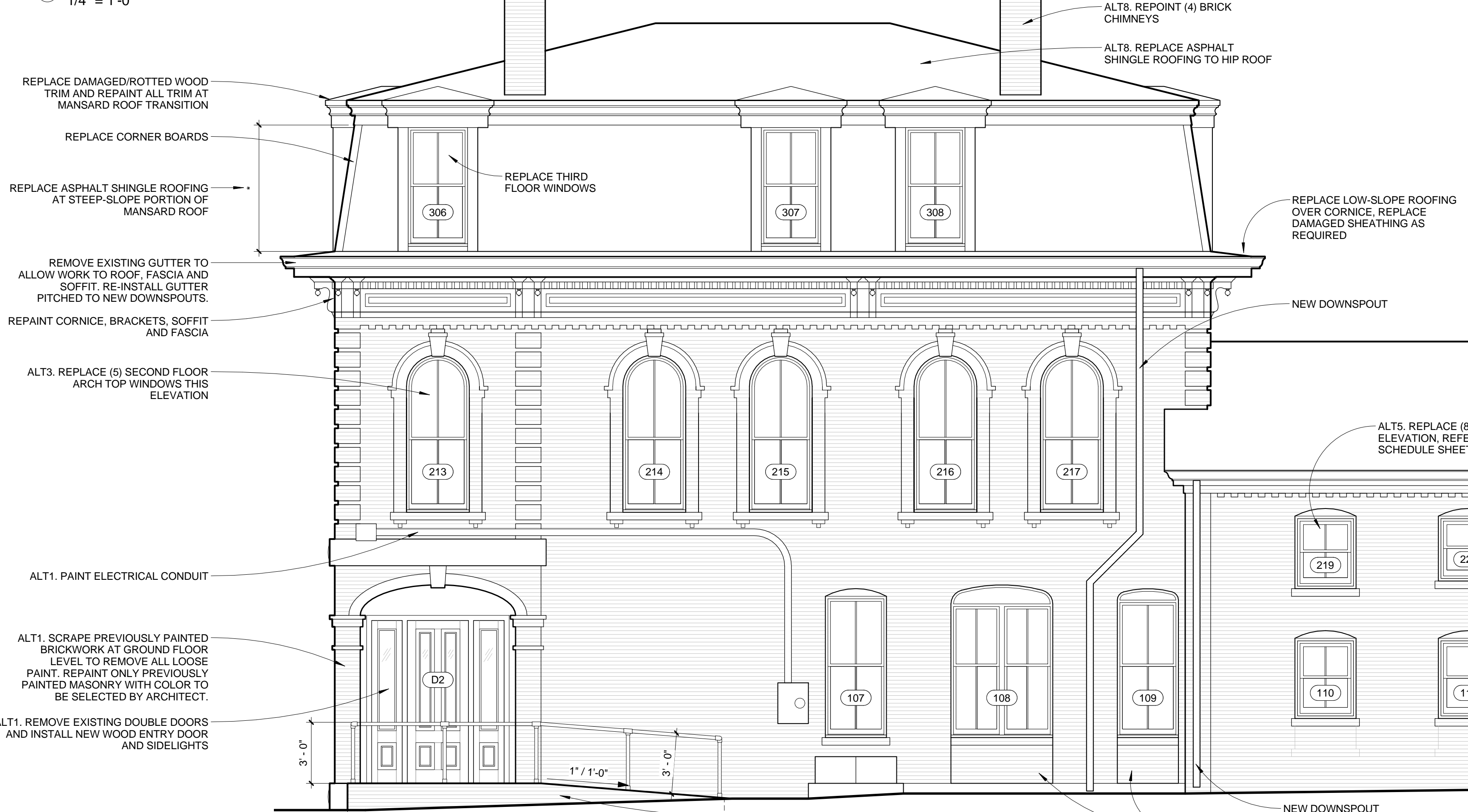
3 SOUTH ELEVATION 1/4" = 1'-0"