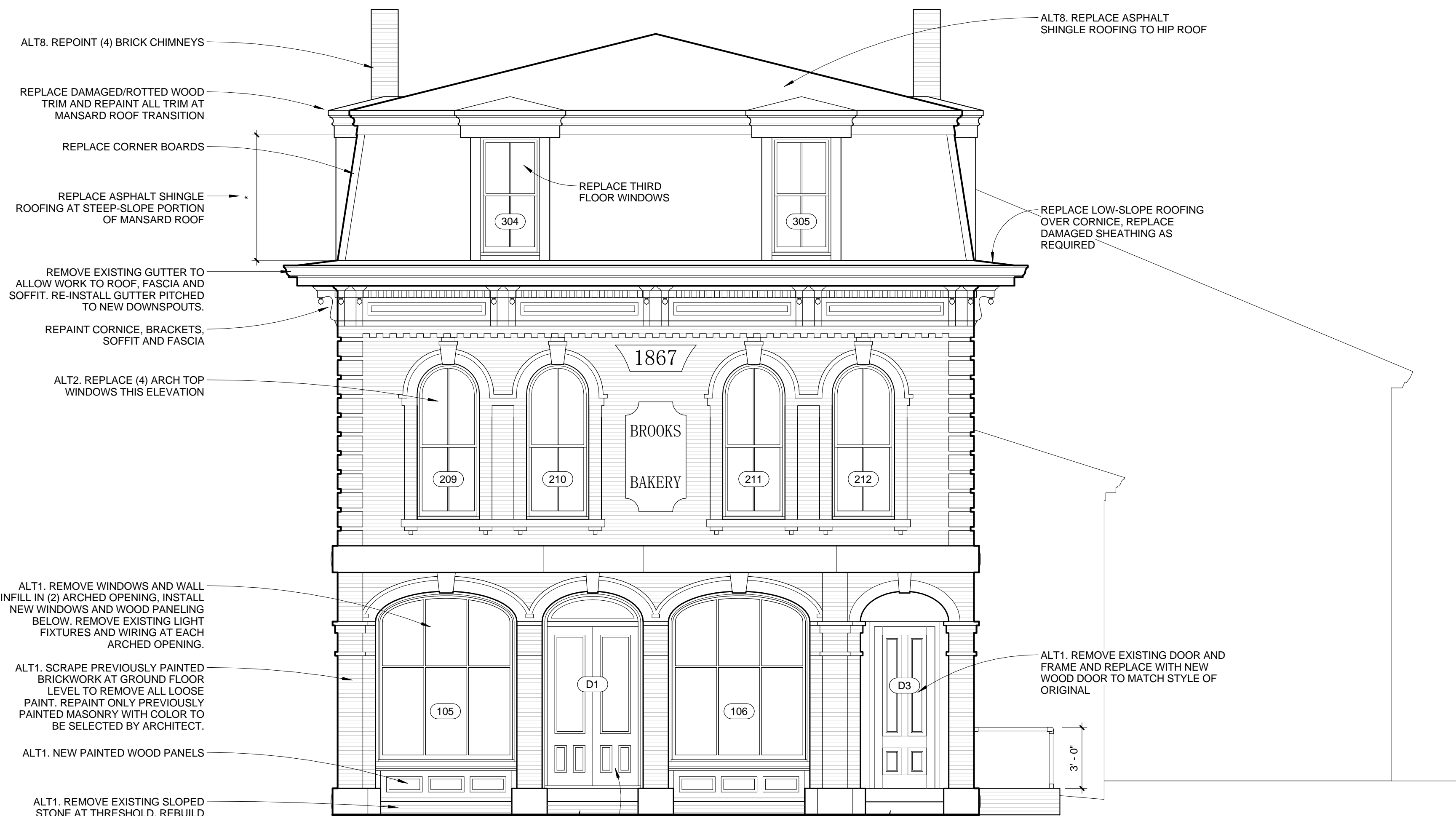
1 WEST ELEVATION - STREETFRONT 1/4" = 1'-0"