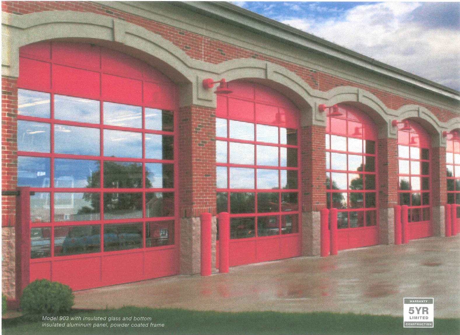
Model 903 with insulated glass and bottom insulated aluminum panel, powder coated frame