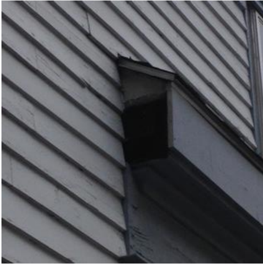
South Face of Residence Closeup of Dormer Joint to be Repaired