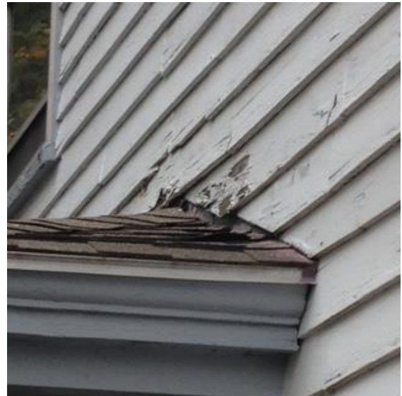
South Face of Residence Closeup of Repairs and Flashing Work to be Done