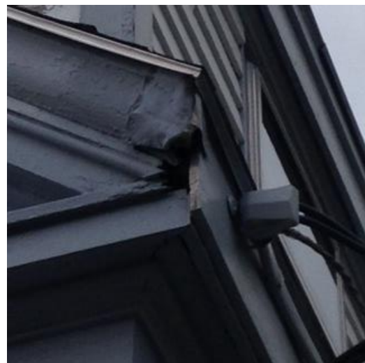
East Face (Front) of Residence Closeup of Bay Window Trim to be Repaired