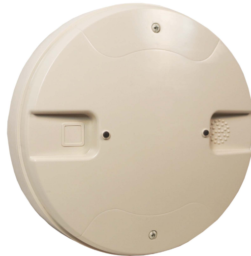
W-GATE Wireless System Gateway