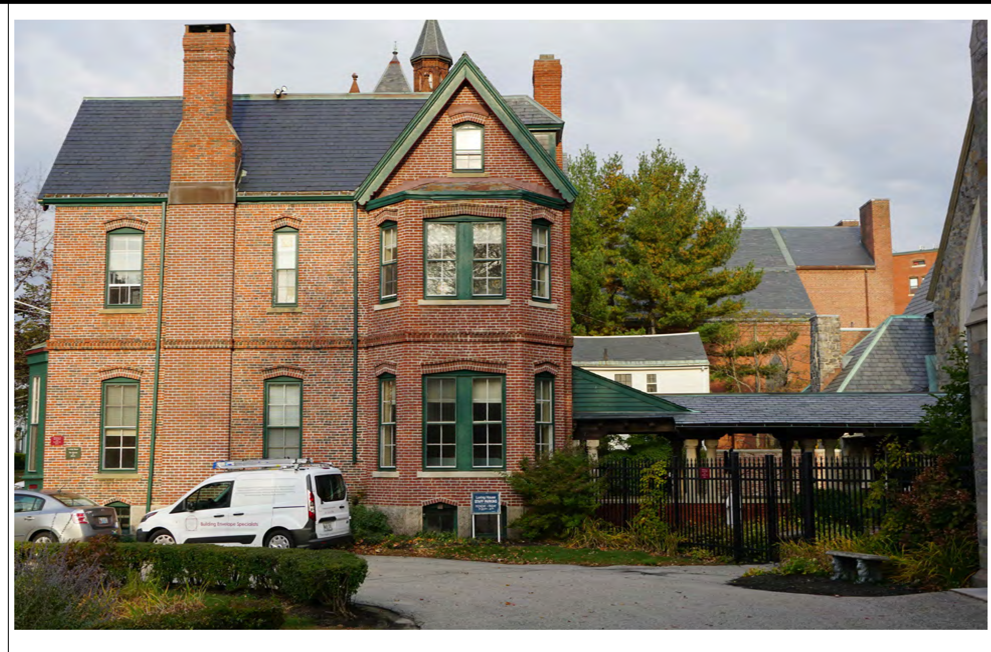
9 IMAGE ELEVATION NTS