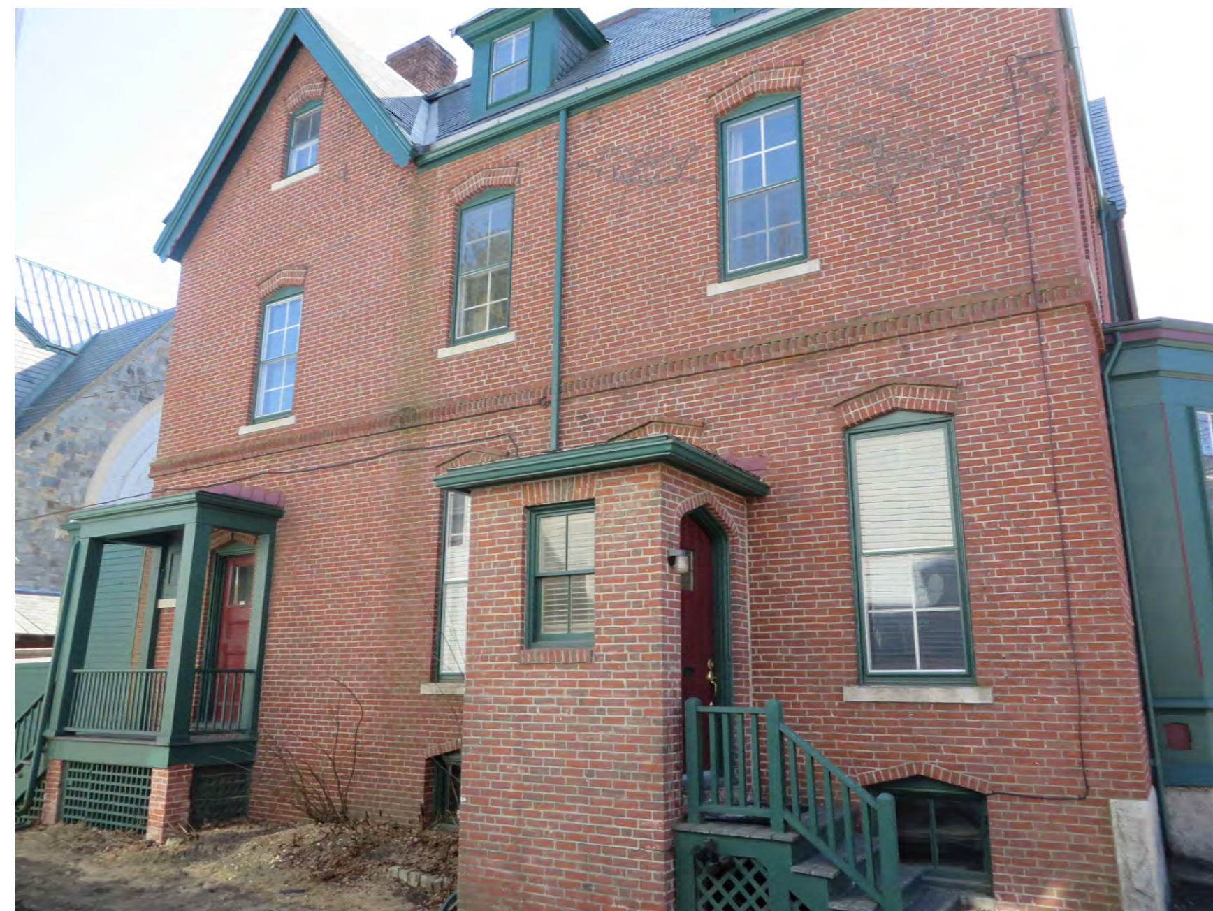
4 IMAGE ELEVATION NTS