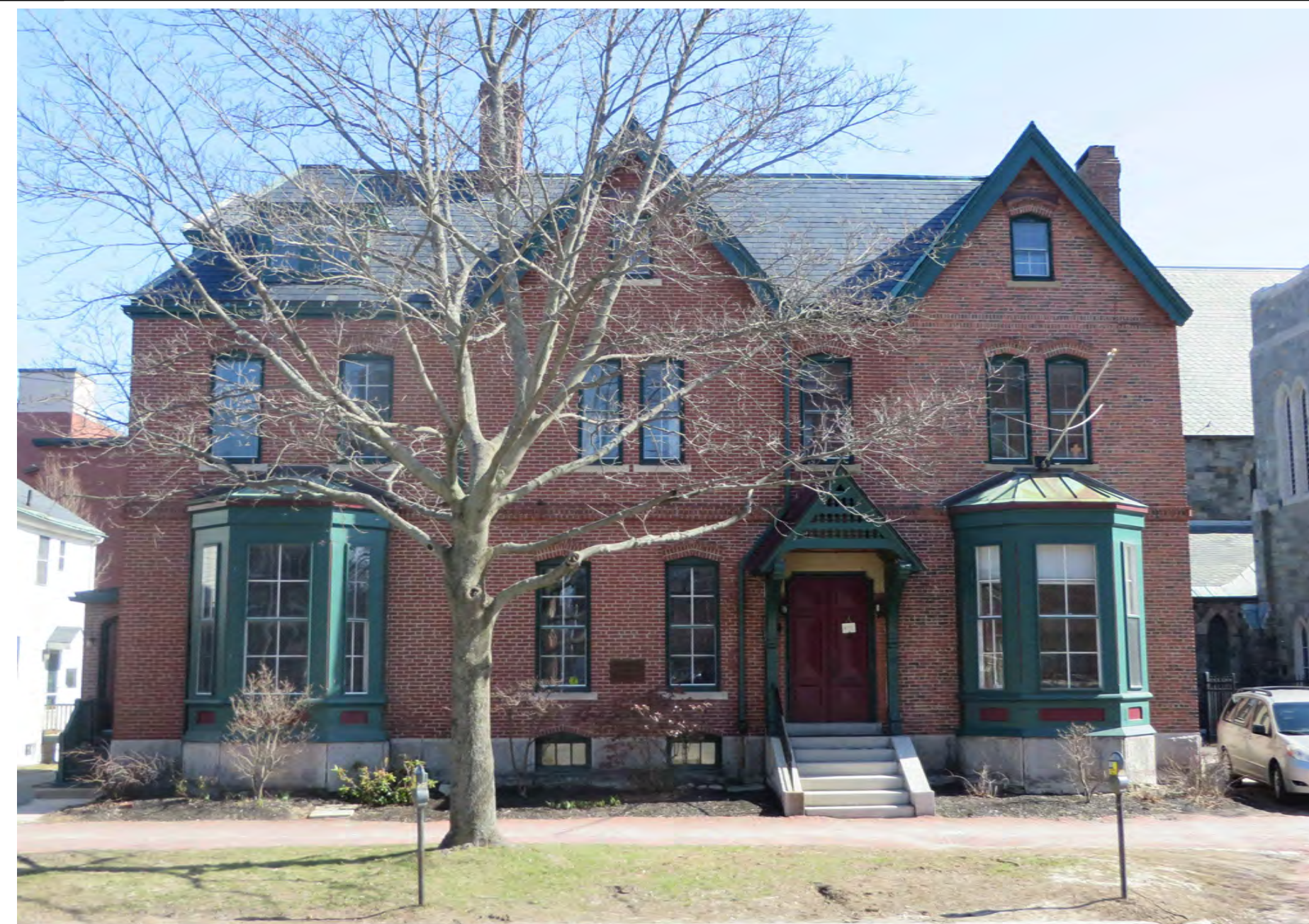
2 IMAGE ELEVATION NTS