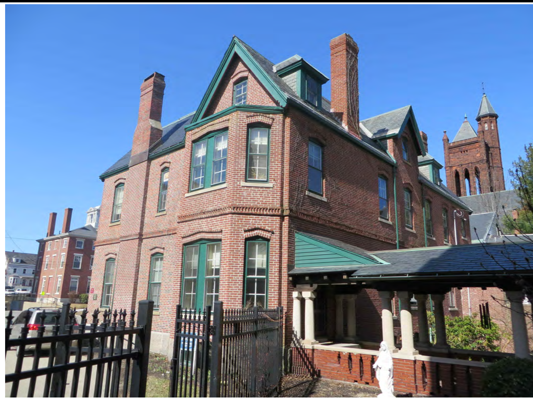
8 IMAGE ELEVATION NTS