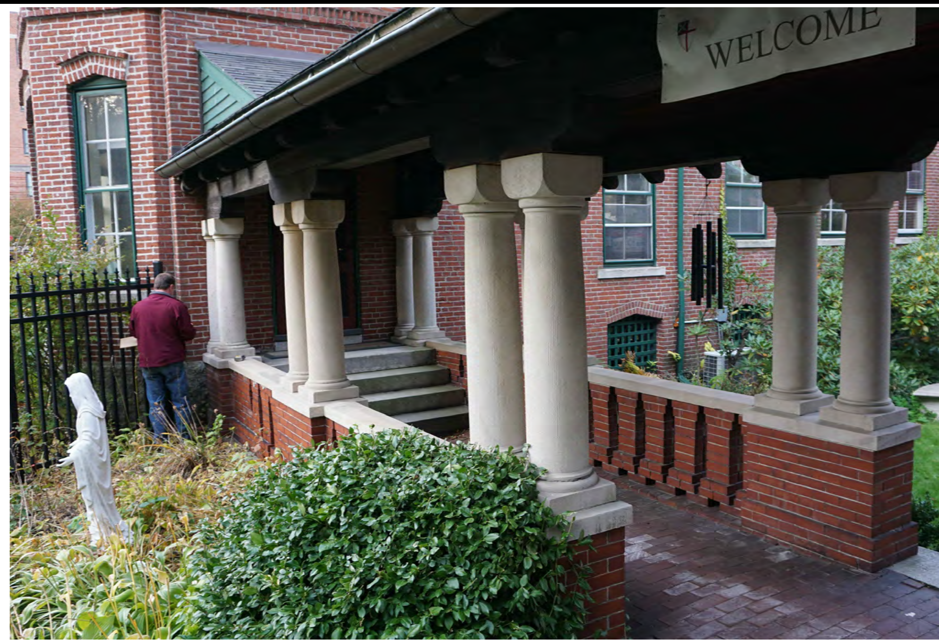
7 IMAGE ELEVATION NTS