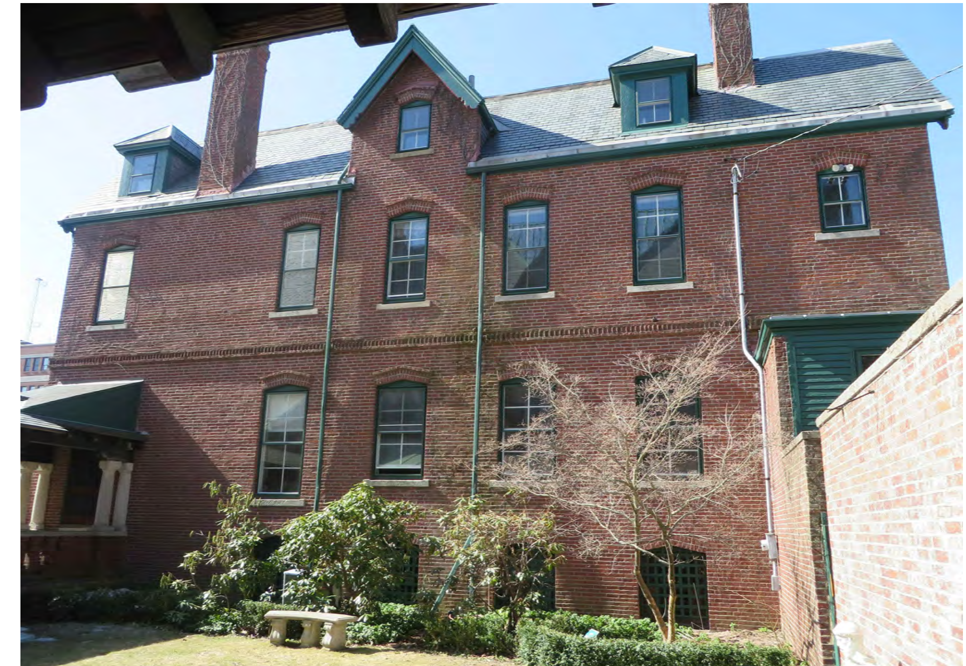
6 IMAGE ELEVATION NTS