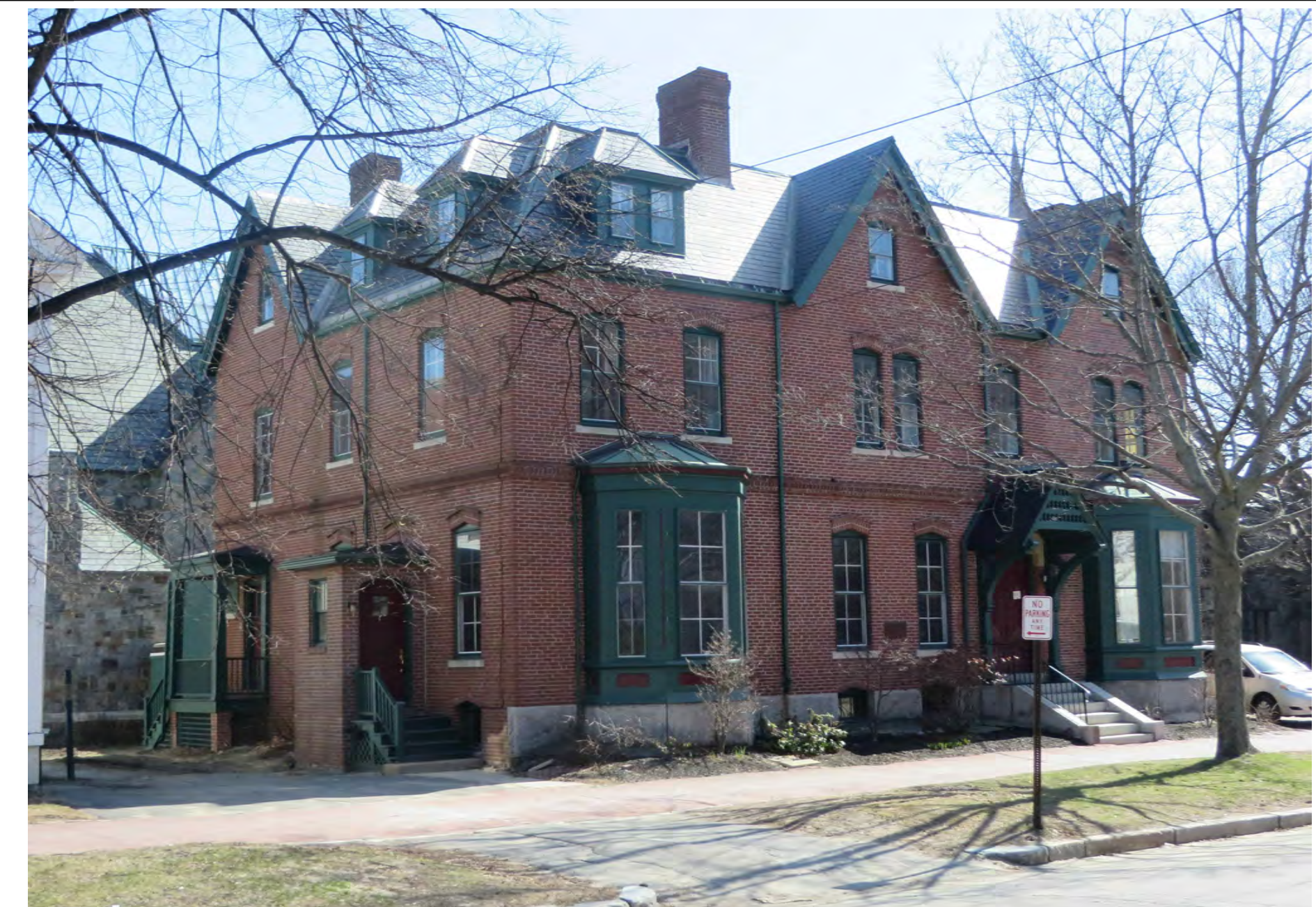
3 IMAGE ELEVATION NTS