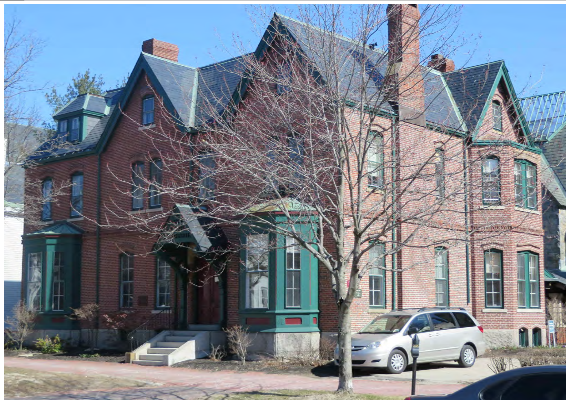
1 IMAGE ELEVATION NTS