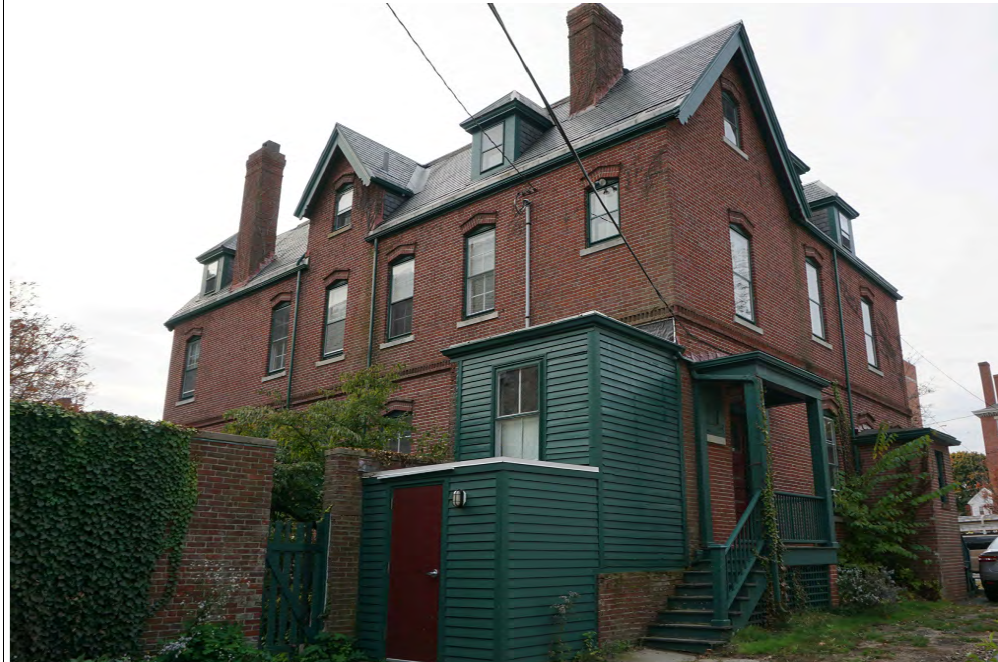
5 IMAGE ELEVATION NTS