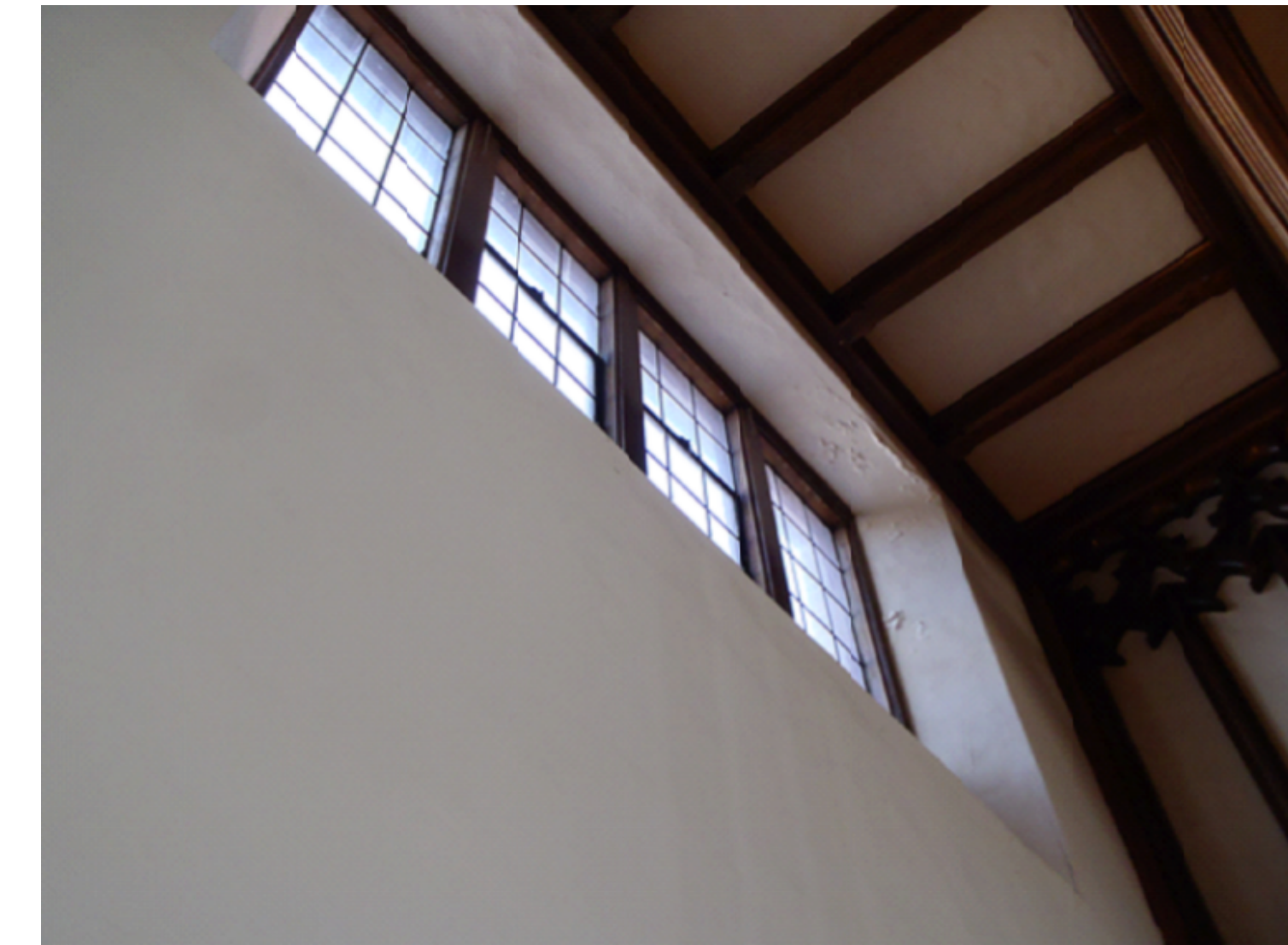
NORTH WALL WINDOW SOFFIT 45 SF