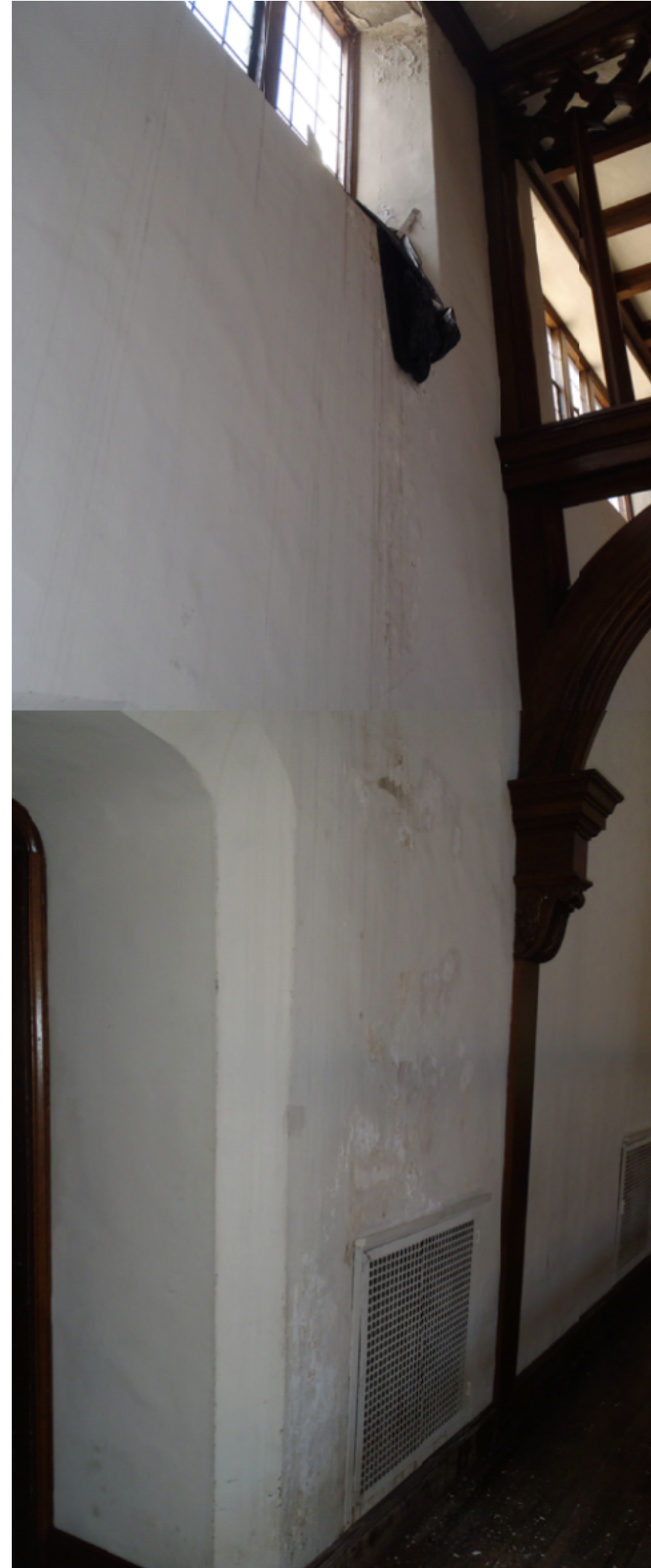
SOUTH WALL EXTENDING FROM BALCONY TO WINDOW SILL 100 SF