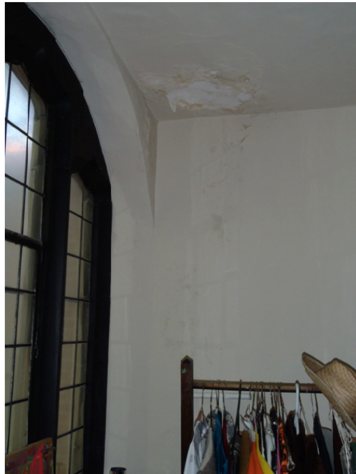
NORTHWEST CEILING/WALL CORNER 50 SF