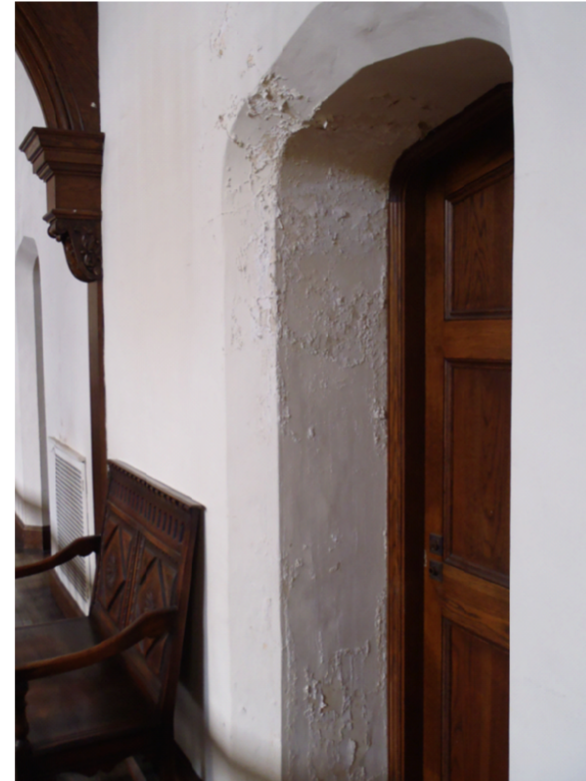
NORTH DOOR 50 SF