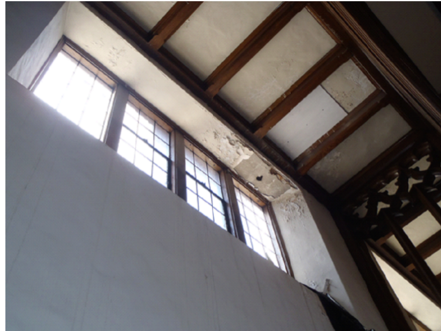
SOUTH WALL EXTENDING FROM WINDOW SILL TO CEILING, INCLUDING WINDOW PERIMETER 175 SF