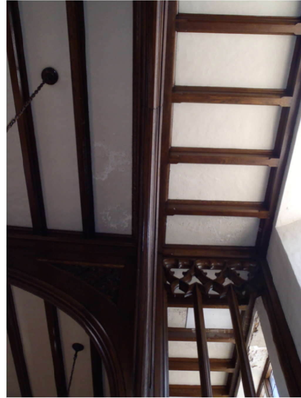
SOUTH WALL CEILING 60 SF