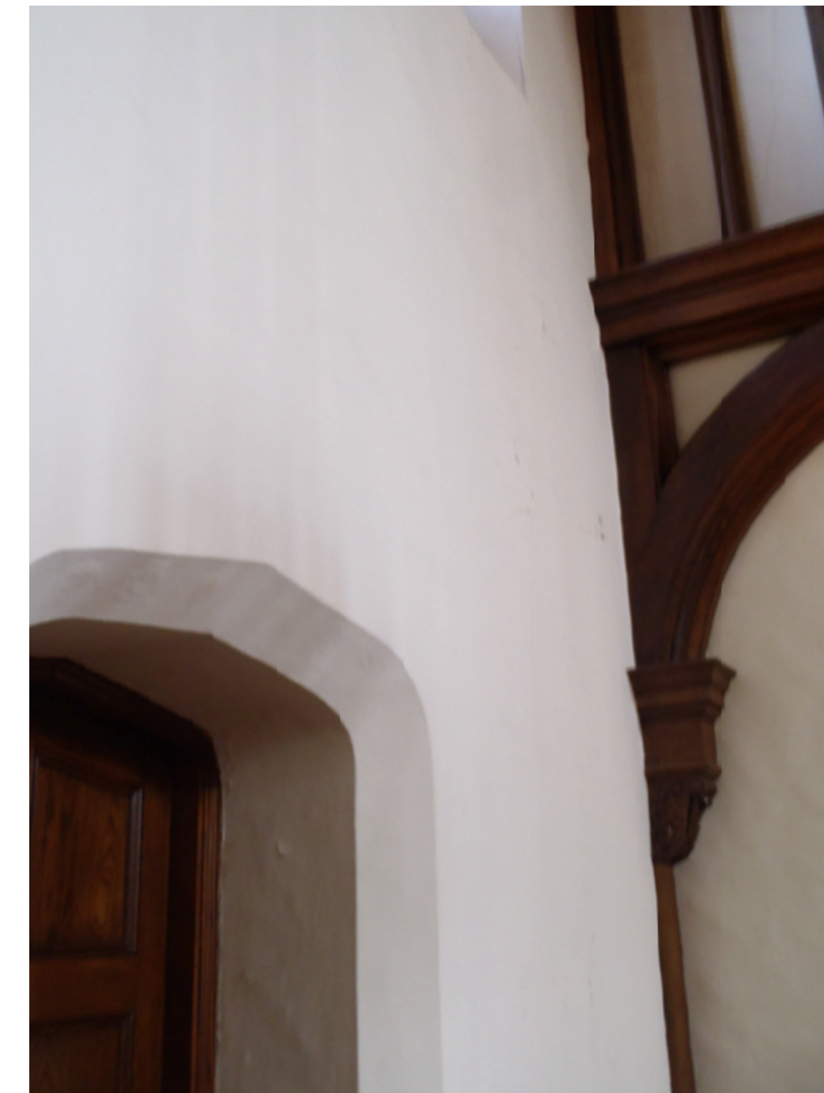
NORTH WALL ADJACENT TO DOOR 45 SF