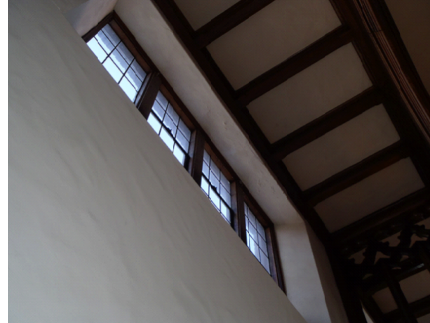
NORTH WALL WINDOW SOFFIT 30 SF