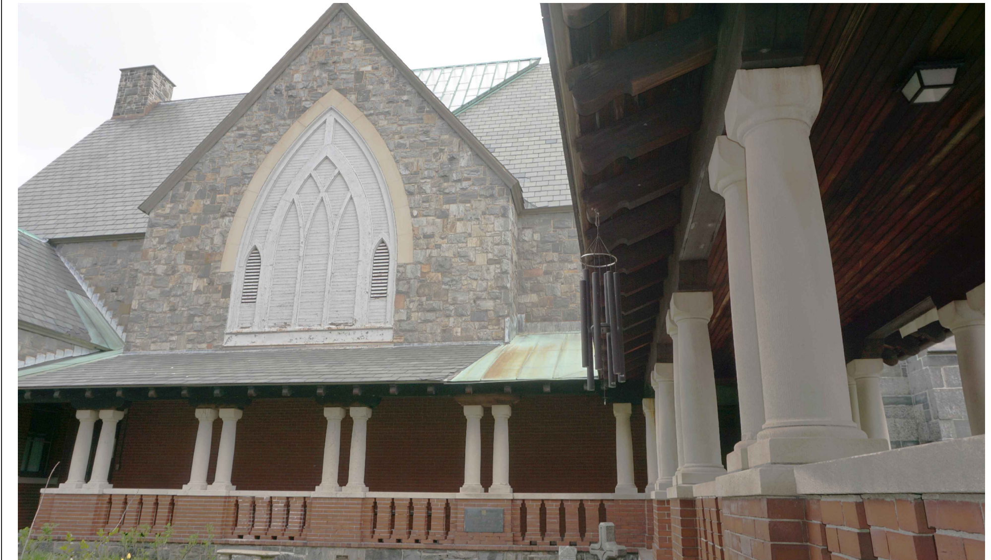
6 IMAGE ELEVATION NTS