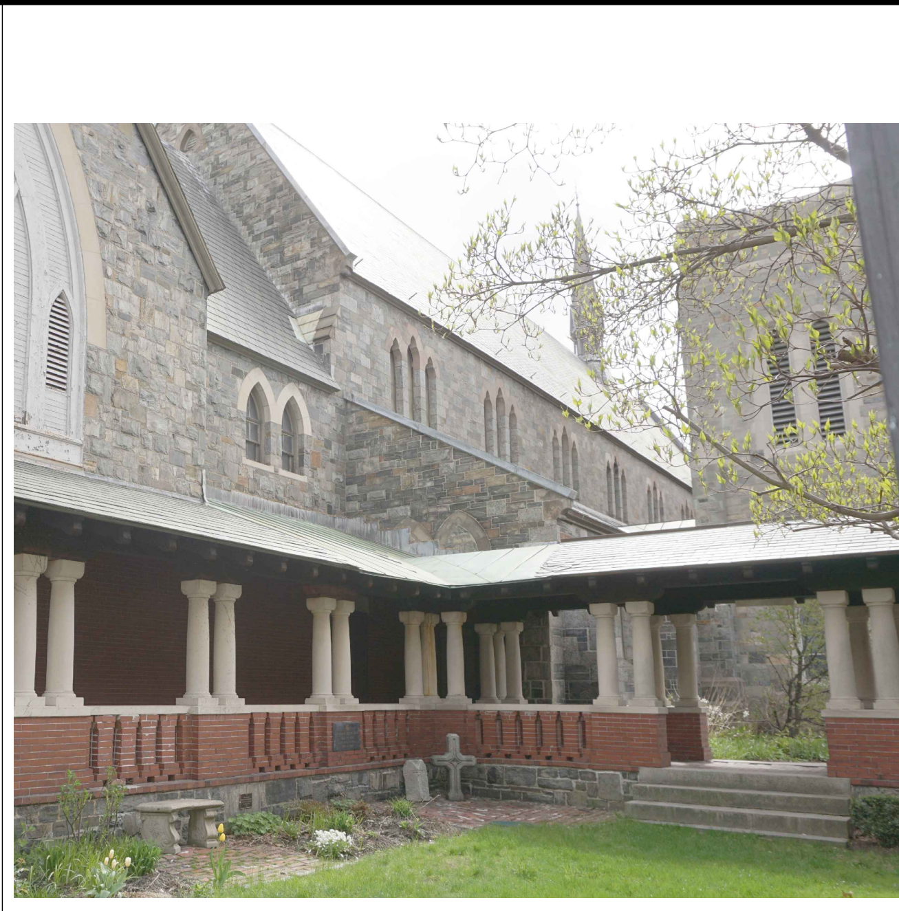
9 IMAGE ELEVATION NTS