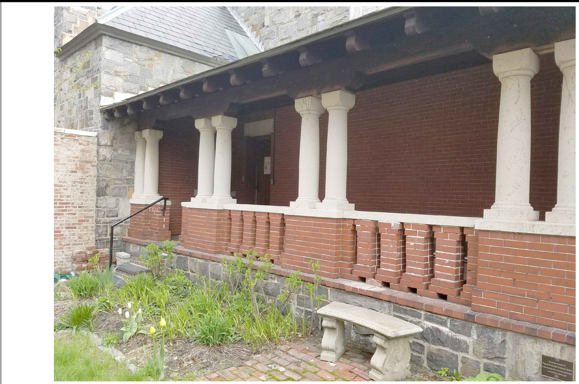
10 IMAGE ELEVATION NTS