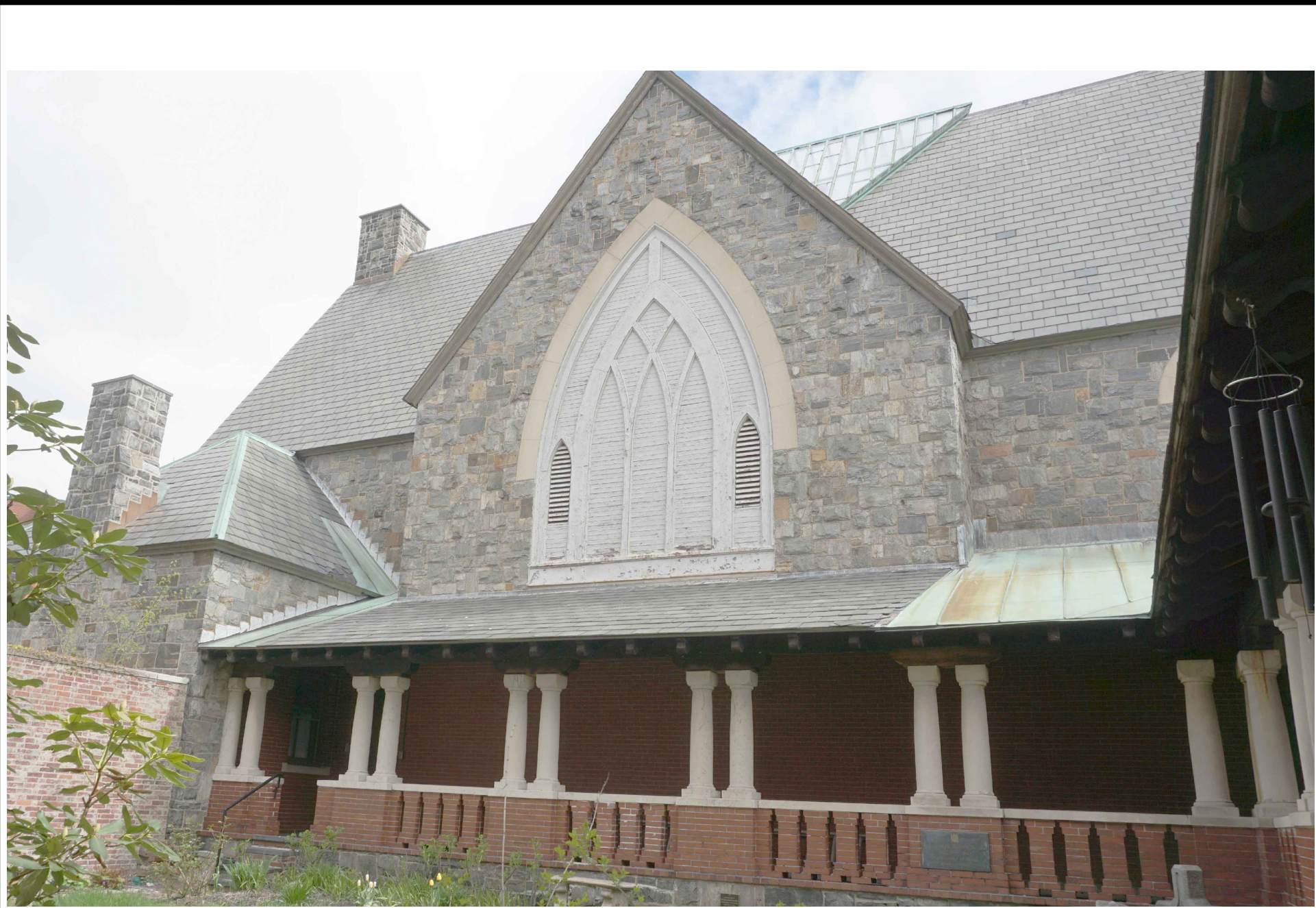
8 IMAGE ELEVATION NTS