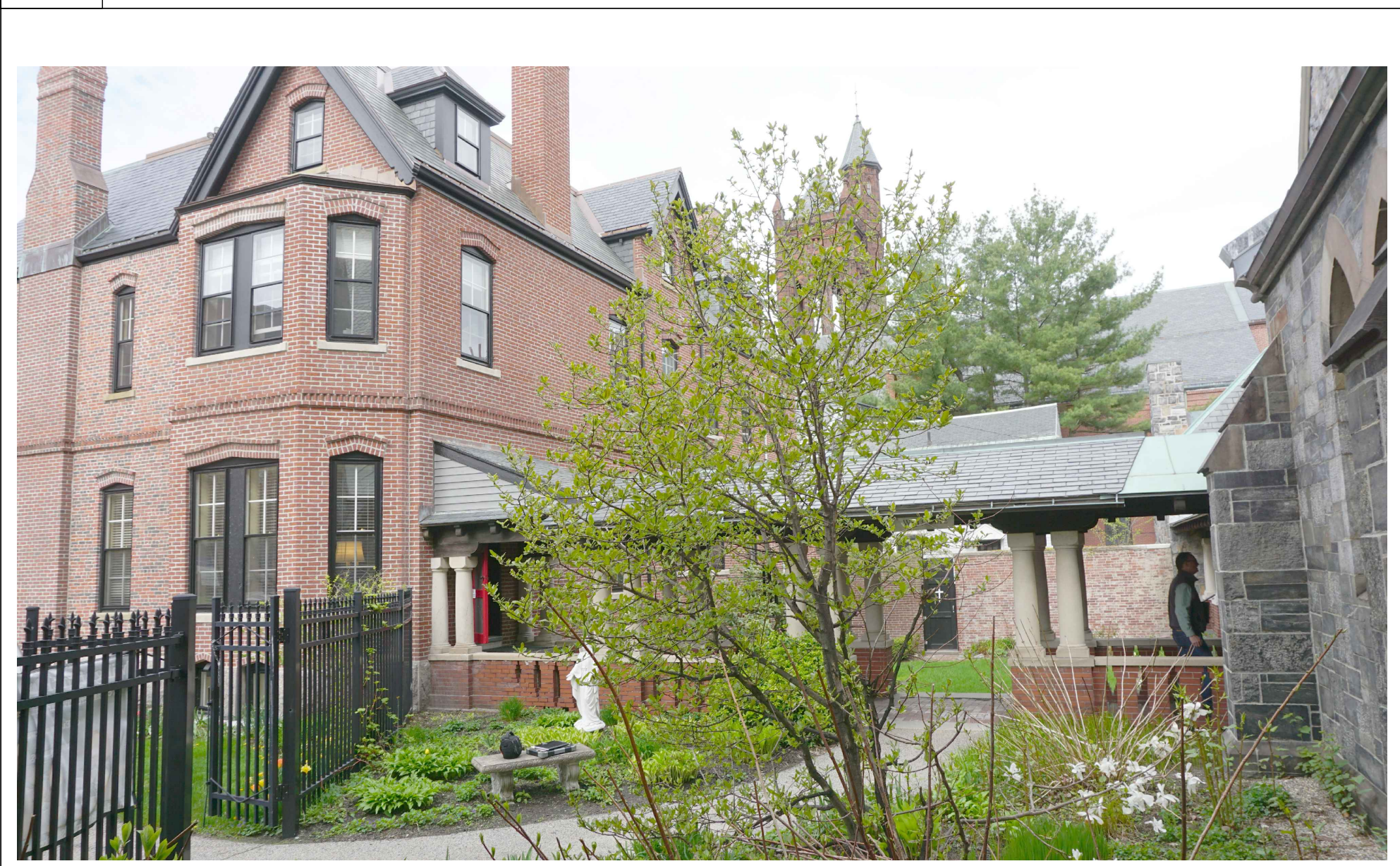
2 IMAGE ELEVATION NTS