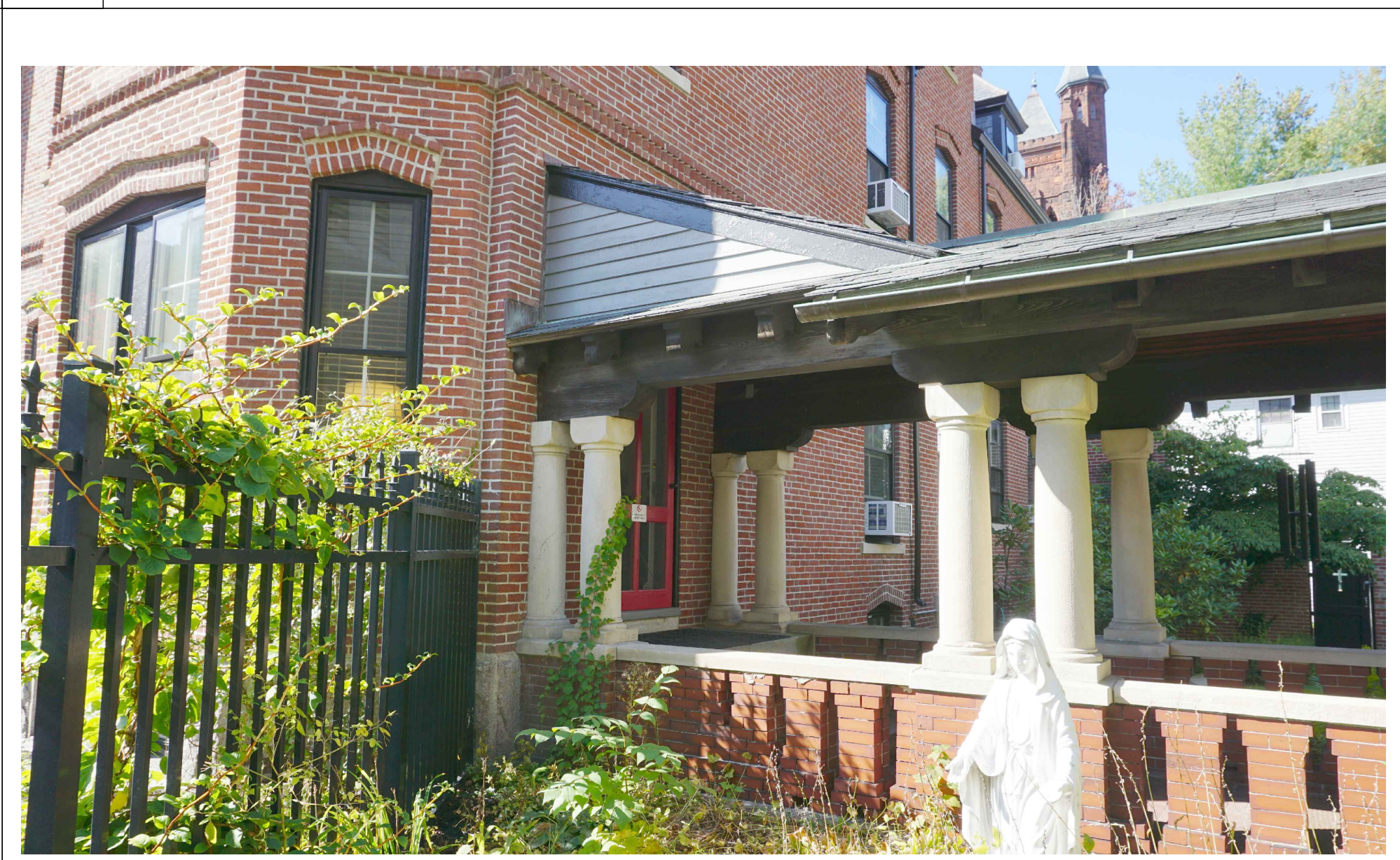
3 IMAGE ELEVATION NTS