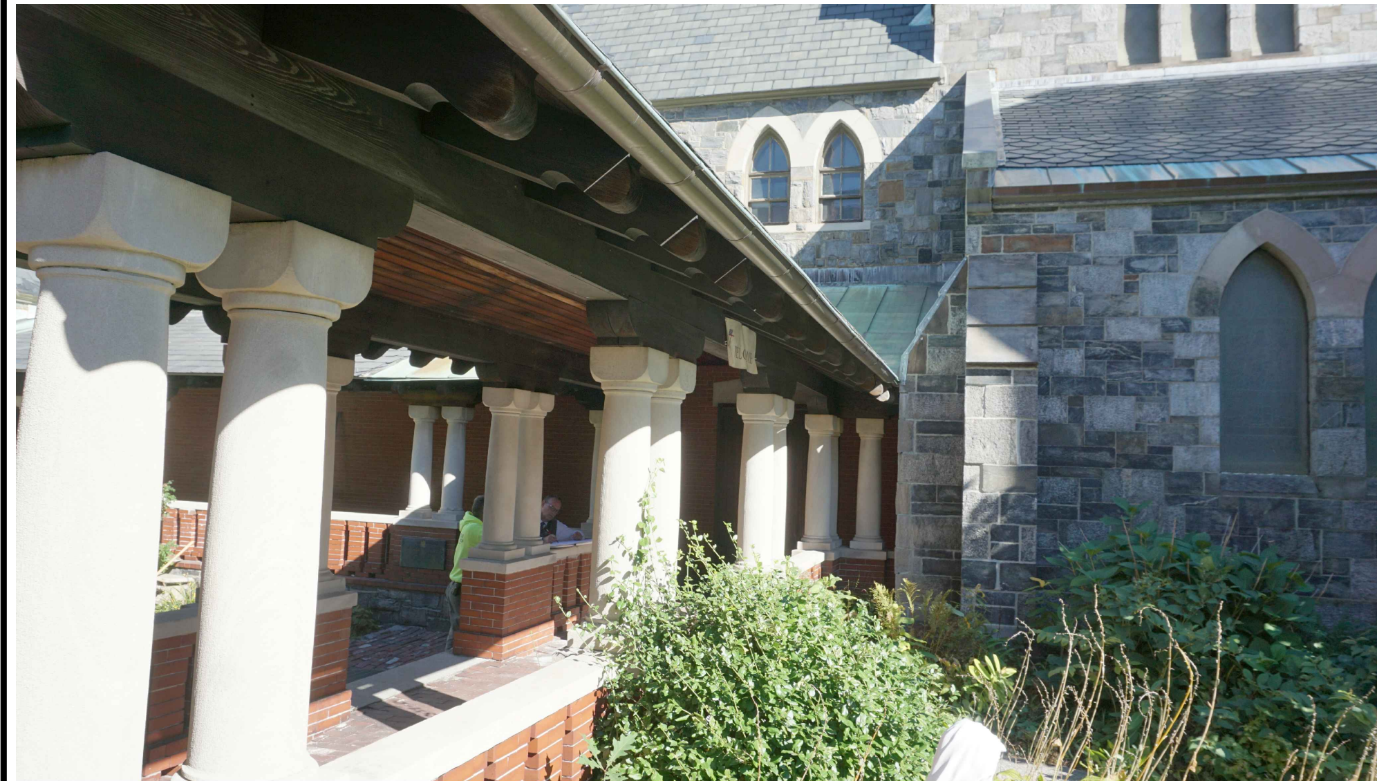
4 IMAGE ELEVATION NTS