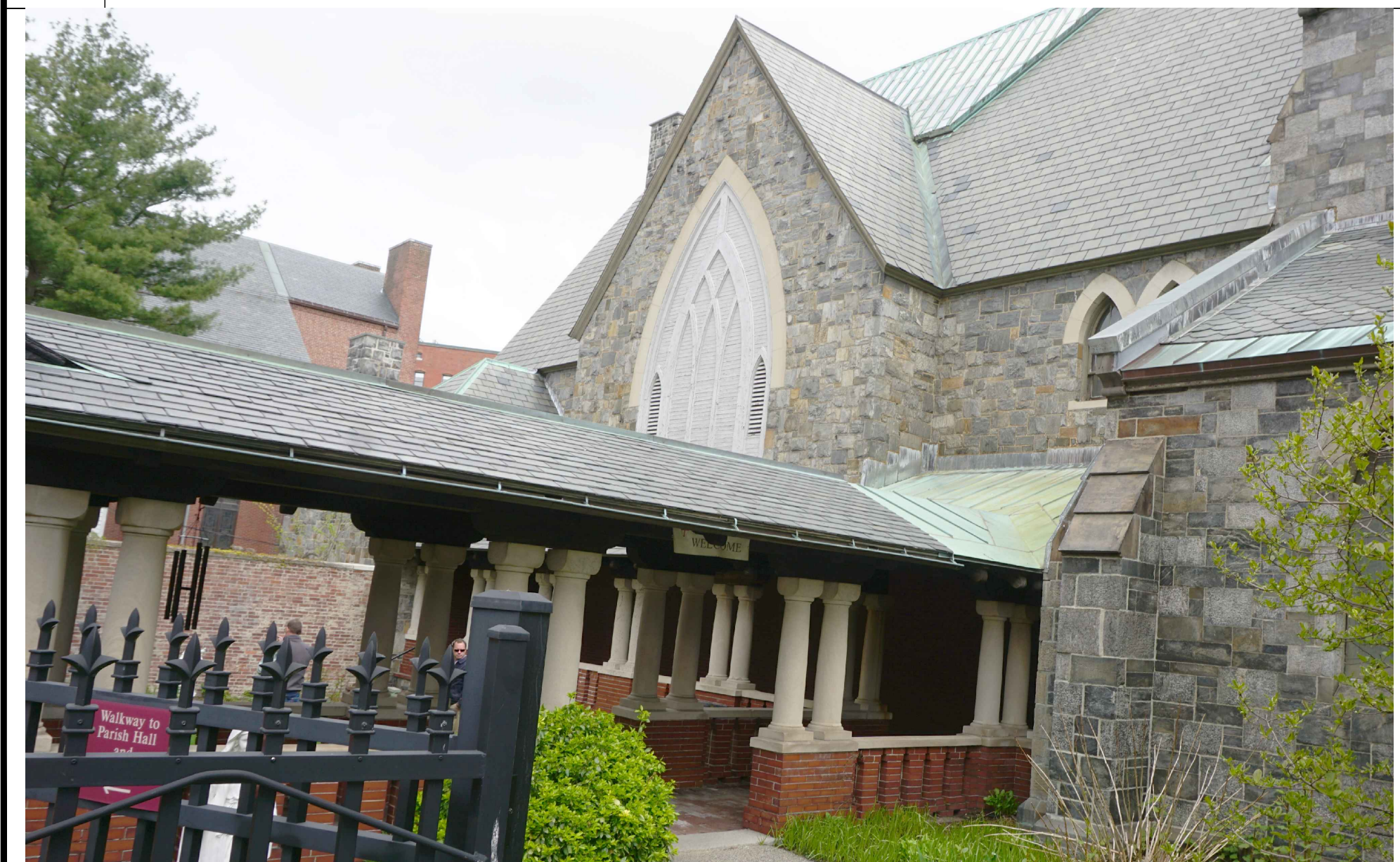
1 IMAGE ELEVATION NTS