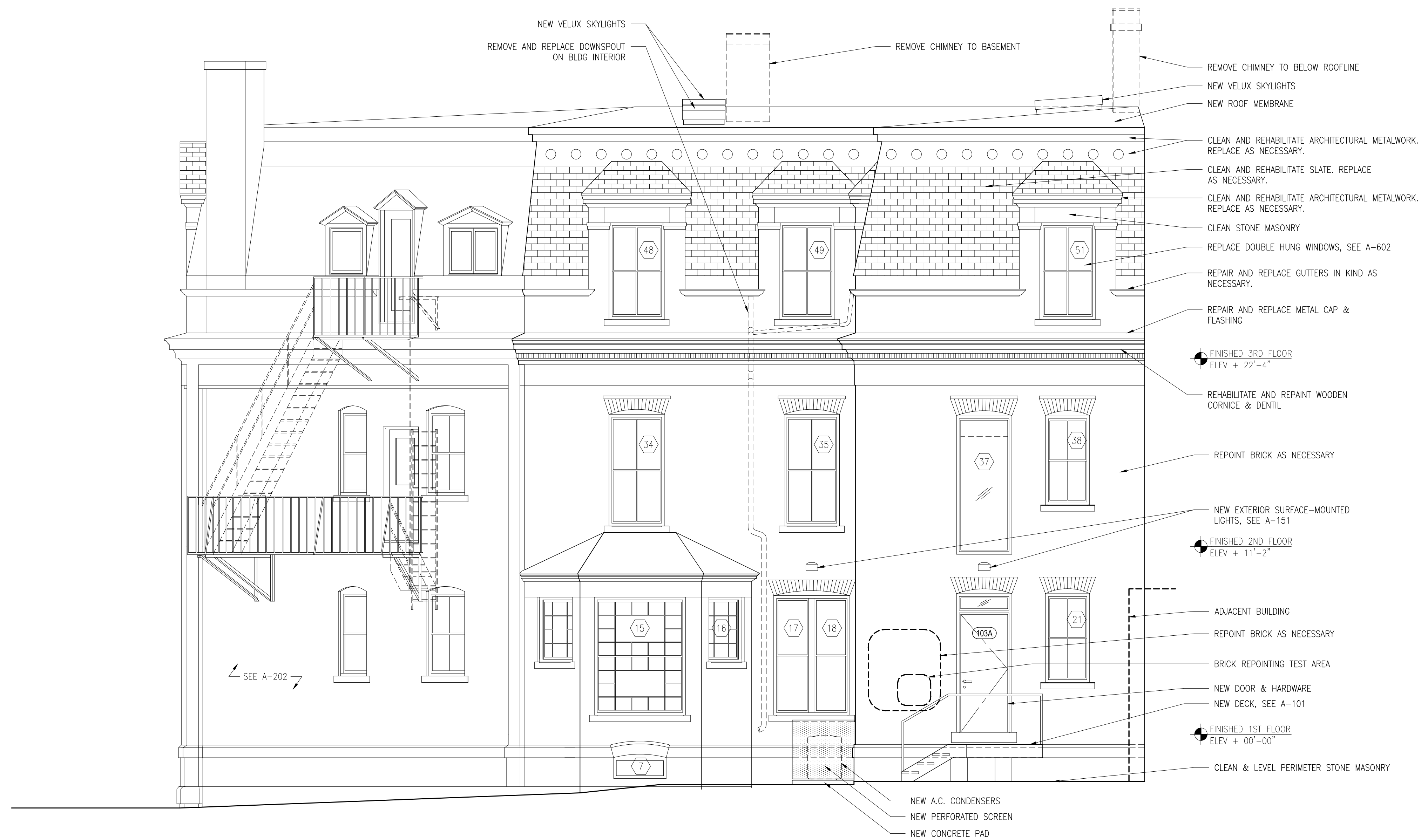
1 SOUTH ELEVATION A-203 1/4" = 1'-0"

P.O. BOX 575 FREEPORT, ME 04032 T: (207) 865-9505