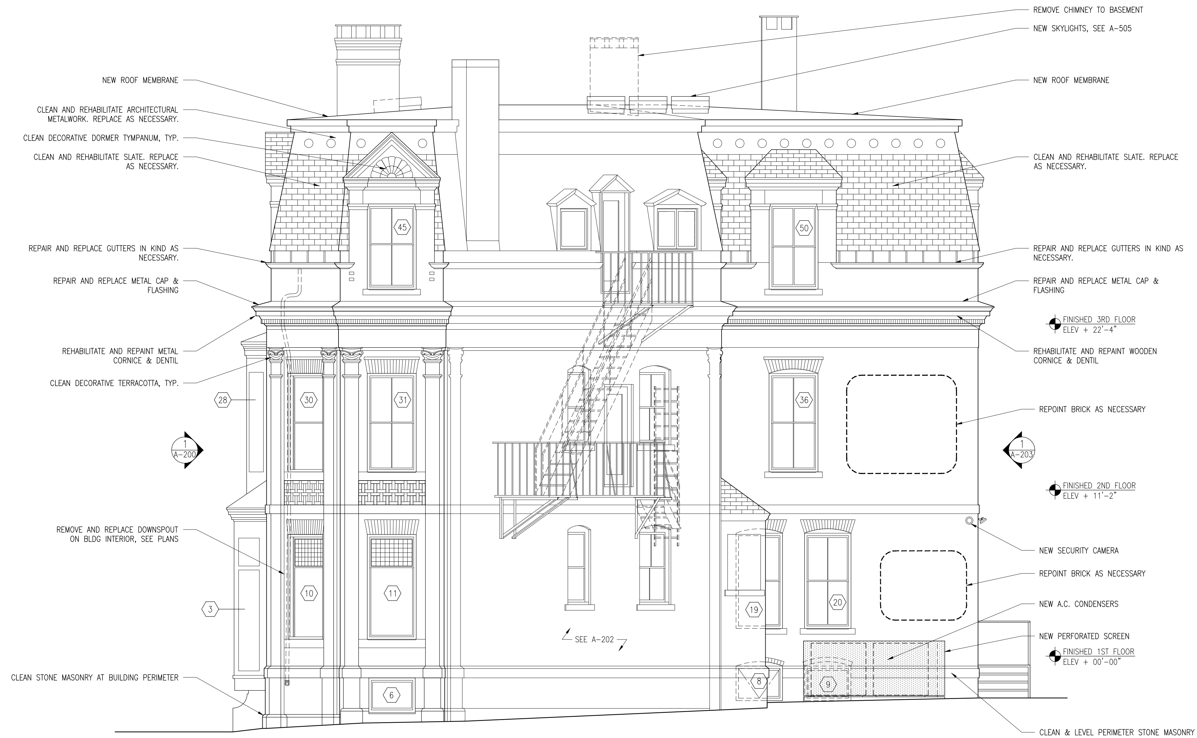
1 WEST ELEVATION A-201 1/4" = 1'-0"

1. ALL EXTERIOR WORK TO FOLLOW SECRETARY OF INTERIOR'S STANDARDS FOR REHABILITATION.