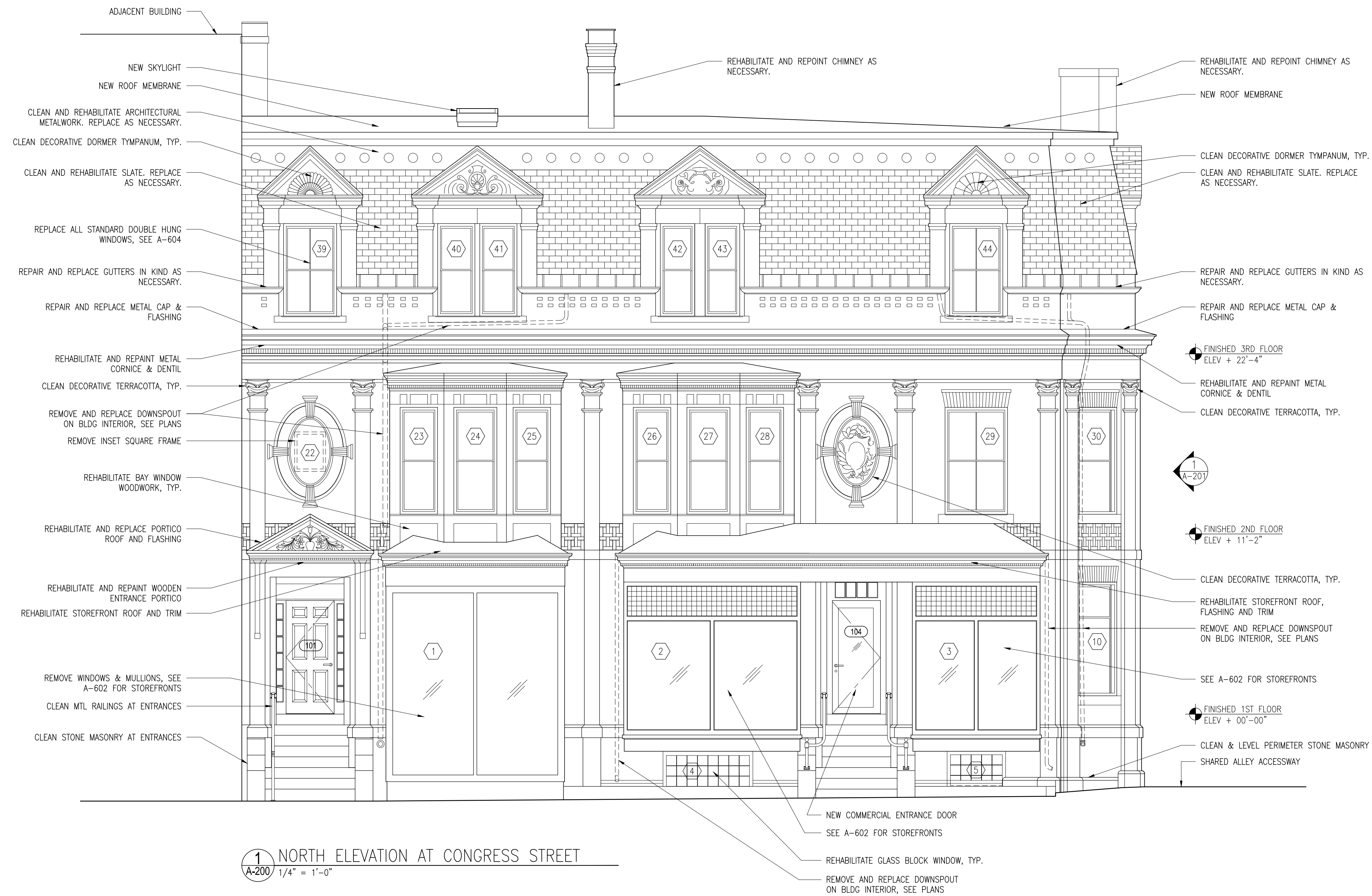
1 A-200 NORTH ELEVATION AT CONGRESS STREET 1/4" = 1'-0"

1. ALL EXTERIOR WORK TO FOLLOW SECRETARY OF INTERIOR'S STANDARDS FOR REHABILITATION.