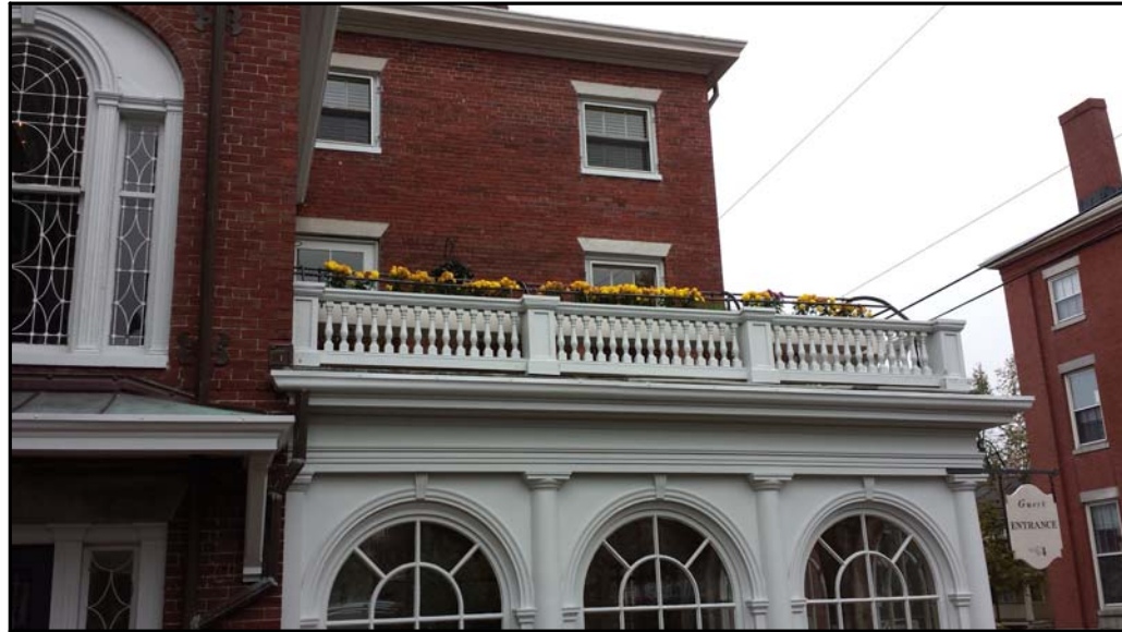
1 EXISTING 'WEST END' BALCONY IRON RAILS AND PLANTERS SK-4a SCALE: N/A