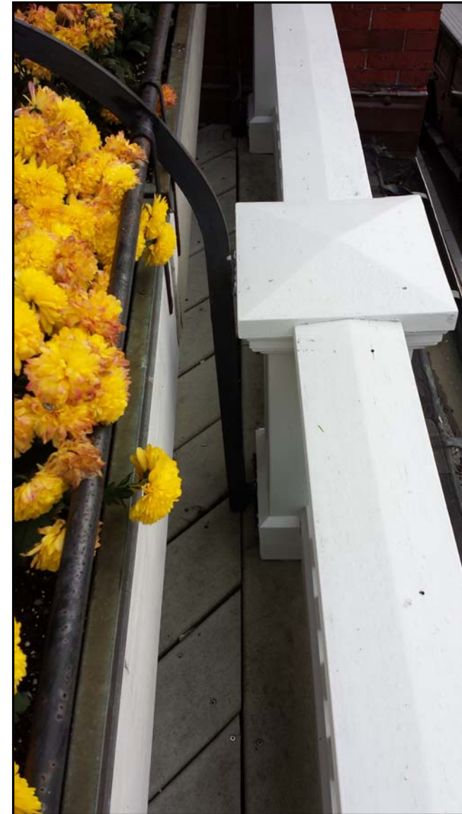
3 EXISTING 'WEST END' BALCONY IRON RAILS - ATTACHMENT SK-4a SCALE: N/A