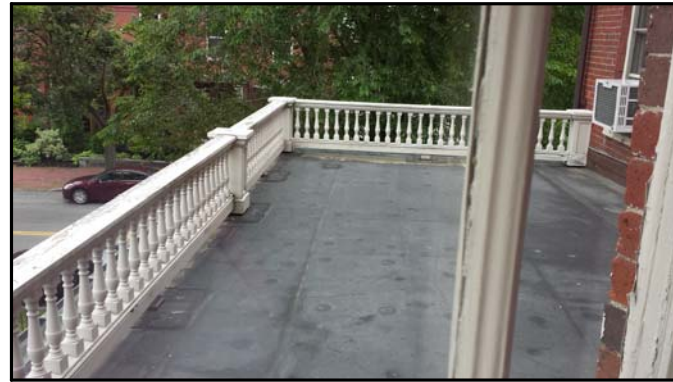
VIEW FROM "OLD PORT" GUEST ROOM

NEW DOOR GRILLE PATTERN TO MIMIC ADJACENT DOUBLE HUNG WINDOWS