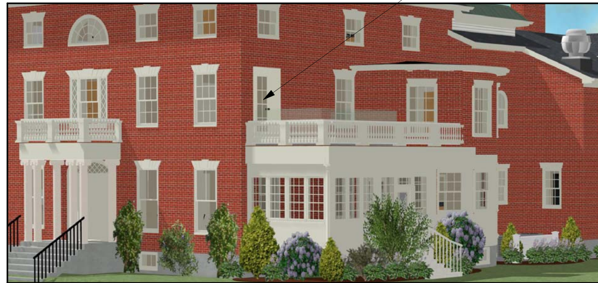
3 RENDERING SHOWING PROPOSED GLASS ROOF-TOP DECK SK-4 SCALE: N/A

NEW DOOR GRILLE PATTERN TO MIMIC ADJACENT DOUBLE HUNG WINDOWS