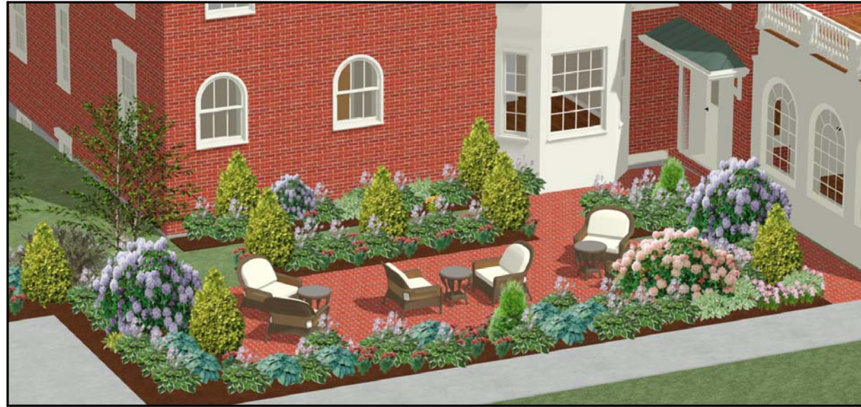
3 RENDERING SHOWING PROPOSED PATIO SK-3 SCALE: N/A